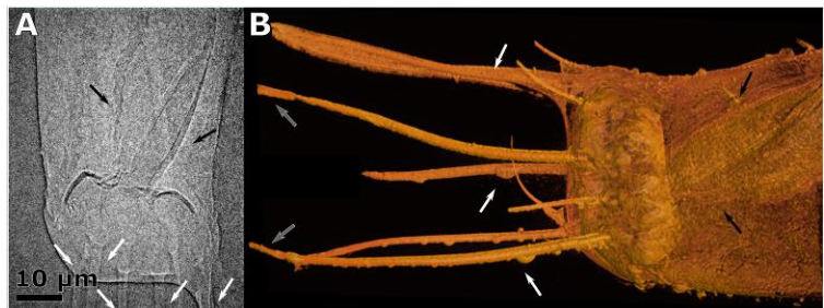
Figure 2. (A) Projection of S. linguis (phase-contrast) and (B) volumetric reconstruction of the insect. Arrows: white indicate the setae, black show the Musculus longitudinalis abdominis dorsalis and grey indicate spoon-shaped structures at the end of two setae.