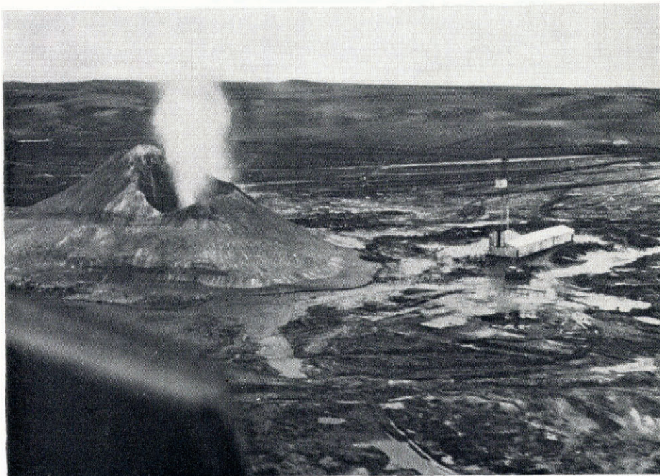
Fig. 1. Aerial view of ice cone which was estimated to be 22 \pm 2 m; 15 July 1970.

DRAKE POINT (lat. 76^{\circ} 26' 33'' N.; long. 108^{\circ} 55' 38'' W.; 34 m a.s.l.) is the name given to a natural gas well drilled on Sabine Peninsula, Melville Island, N.W.T., Canada, about 11 km inland from the topographic feature of the same name. On 12 July 1969 ( Oilweek , 1970[a]) the drill pierced a gas zone which had sufficient pressure to rupture the drill casing and expel natural gas into the air. Mixed with the gas was drilling mud, water and water vapour which reached the surface in volcanic fashion. The