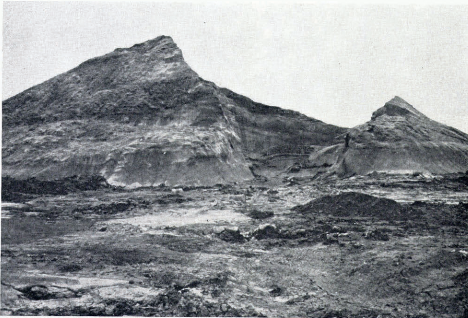
Fig. 3. Detailed structure of ice cone; 16 August 1971.