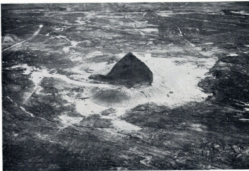
Fig. 4. Condition of ice cone on 3 August 1972 after ablation had reduced its height to 12 \pm 2 m.

This condition is shown in Figure 1 taken from the air on 15 July 1970 at which time the height of the cone was estimated to be 22 \pm 2 m. The building to the right is the drill rig drilling a relief well to gain control of the gas flow. The subsequent history of the cone is shown in Figures 2, 3 and 4. Figure 2 shows the “dormant” cone on 2 July 1971 when it was already showing marked effects of ablation with a breached northern rim. Figure 3 shows detail of the structure of the cone (16 August 1971) and the valve which has two pieces of wood lying on top of it. Three 45 gallon fuel drums give an indication of scale. The height of the cone had decreased to an estimated 16 \pm 2 m. By 3 August 1972 the cone had further ablated to the condition shown in Figure 4, when the height was estimated at 12 \pm 2 m. A very