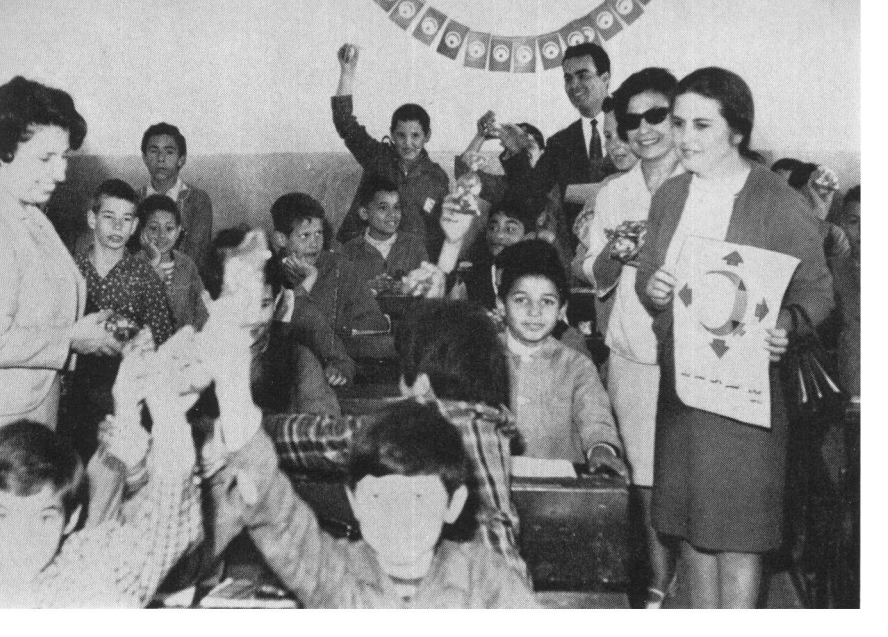
Ladies of the Tunisian Red Crescent distributing toys in a school.