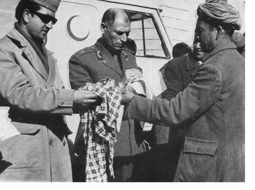
Afghanistan: clothing and food distribution by the Red Crescent.