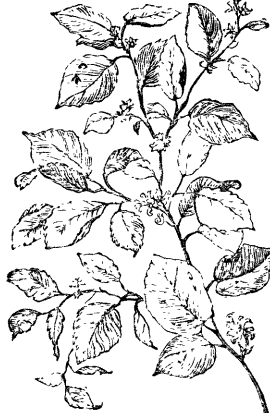
The Witch Hazel Plant.

This drug is highly commended by the British Medical Association's Committee on Therapeutics. Hazeline, being prepared from the fresh green twigs, contains all the valuable volatile principles of the plant Witch Hazel, and is much more uniform and reliable in its action than are the tinctures, fluid extracts, etc., prepared from the dried bark.