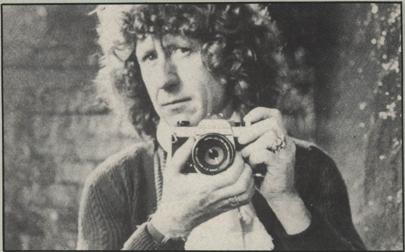
Top fashion and advertising photographer Peter Gough, reflecting on the new Pentax K1000.