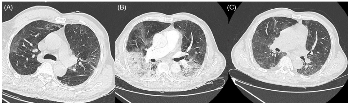
Lung CT Imaging Showing Pulmonary Lesions on Day 1 (A), Day 10 (B), and Day 52 (C).

anticoagulation due to pulmonary embolism suspicion. Angio CT of the thorax was not performed due to his renal function deterioration. He received progressive intravenous hydration with little improvement of his creatinine level that subsequently stabilized at 260 µmol/L.