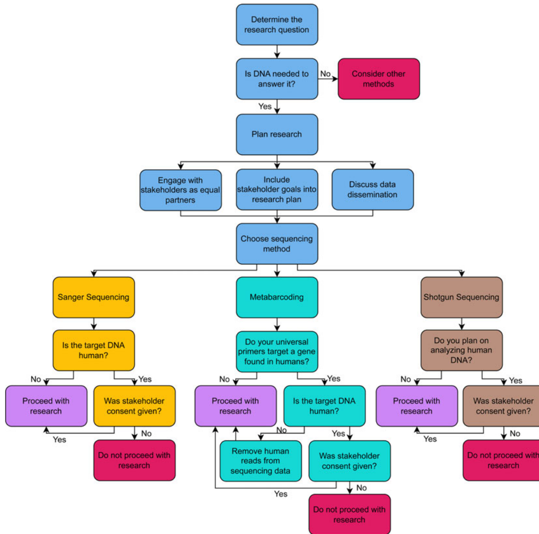
FIGURE 3. Example research flow for planning composite genetic research. First, a research question is established, and whether DNA analysis is needed to answer it is considered. Researchers collaboratively engage with stakeholders, integrate stakeholder goals into the research plan, and discuss data dissemination. The sequencing method can be chosen based on the type of data needed and whether stakeholder consent was given.

comprehensive and do not offer aDNA or composites the same protections and regulations as Ancestor remains and living subjects (Fleskes et al. 2022), they can act as a baseline when planning research. In a fully collaborative, open framework, community partners are included in the creation and implementation of the research plan, and their research goals are equally considered to those of the researchers (Alpaslan-Roodenberg et al. 2021; Fox and Hawks 2019; Matisoo-Smith 2019; Sirak and Sedig 2019; Wagner et al. 2020). This improves research transparency, expands research goals, and helps establish relationships of trust between researchers and other stakeholders (Claw et al. 2018; Handsley-Davis et al. 2021; Tackney and Raff 2019).