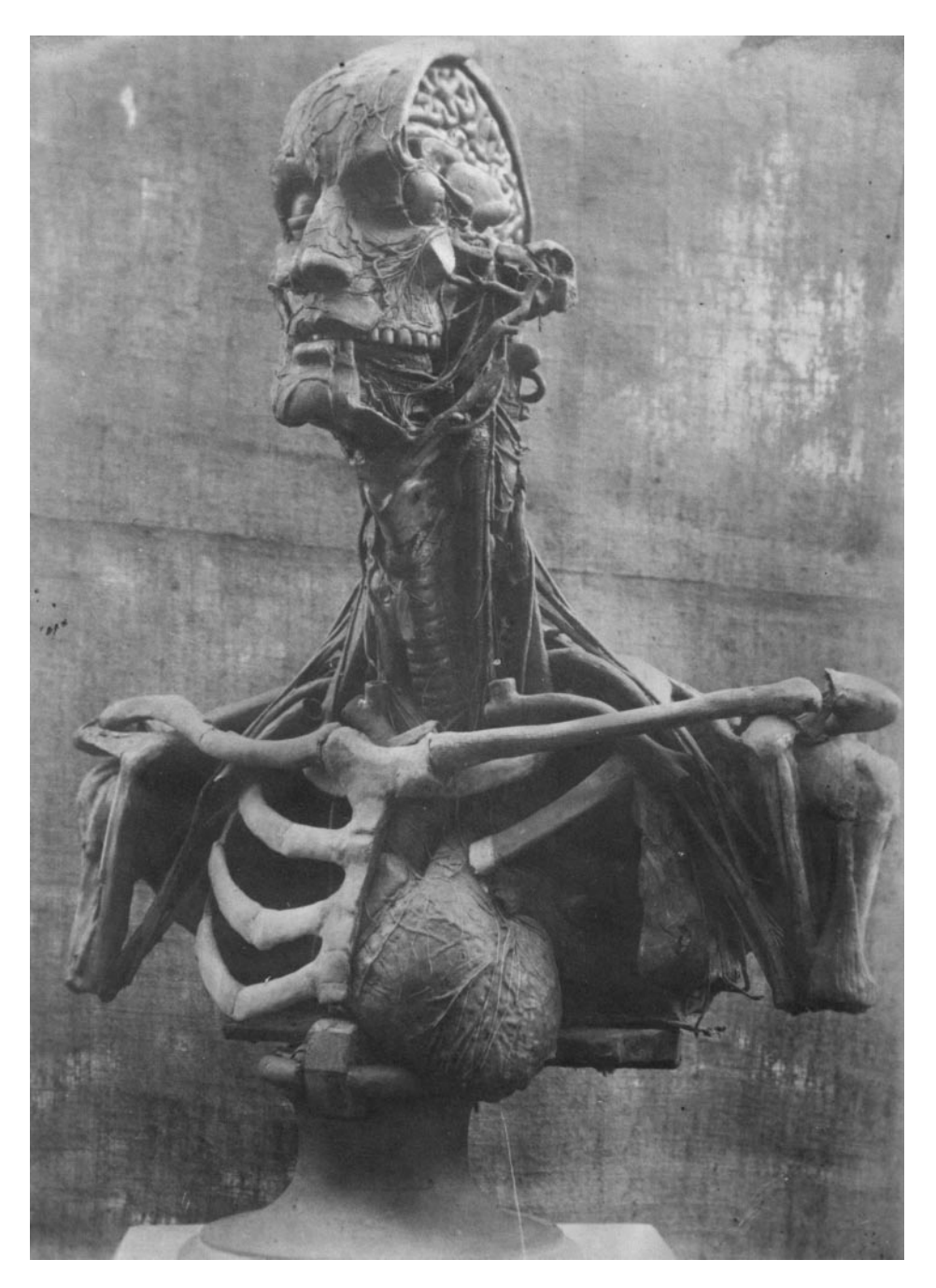
Figure 5: Photograph of an "[e]nlarged anatomical head modelled by Paul Zeiller I in the year 1860–1864 in Munich", possibly the most dissected in a series of three enlarged male busts displayed in his anthropological museum: Führer durch die Säle des anthropologischen Museums, Munich, 1862, pp. 40–2. From 'Ehren-Buch der Familie Paul Zeiller II', c.1918, courtesy of Elsbeth Schramm.