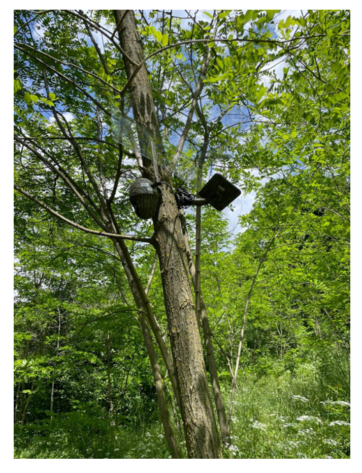
Figure 3. Camera trap installed in the field in order to assess bait acceptance by not-owned dogs.