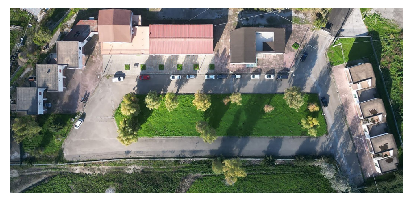
Figure 1. Aerial photograph of the fenced area located within the Center for Monitoring Parasitic Diseases (CREMOPAR, Campania region, southern Italy), characterized by the presence of lawn and trees.

Anthelmintic tablets for dogs (weighing between 5 and 25 kg), containing PZQ 125 mg and milbertycin oxime 12.5 mg