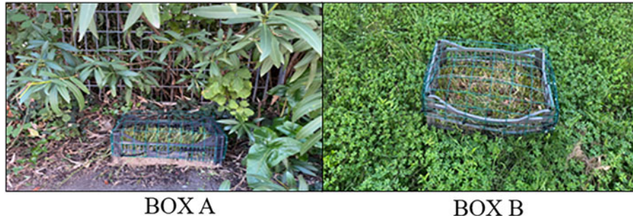
Figure 2. Box A (covered under a bush) and Box B (exposed to sunlight) used to assess the integrity of the baits over time.

All statistical analyses were performed using SPSS® Statistics Software (v.26, IBM, Armonk, NY, USA), and a significant level of P < 0.05 was used.