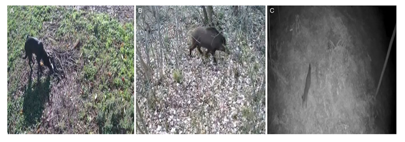
Figure 5. Images of the main consumers of the double PZQ-laced baits in the field captured by camera trap: not- owned dog (A), wild boar (B) and fox (C).