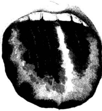
Fig 2. Tongue seen from below.