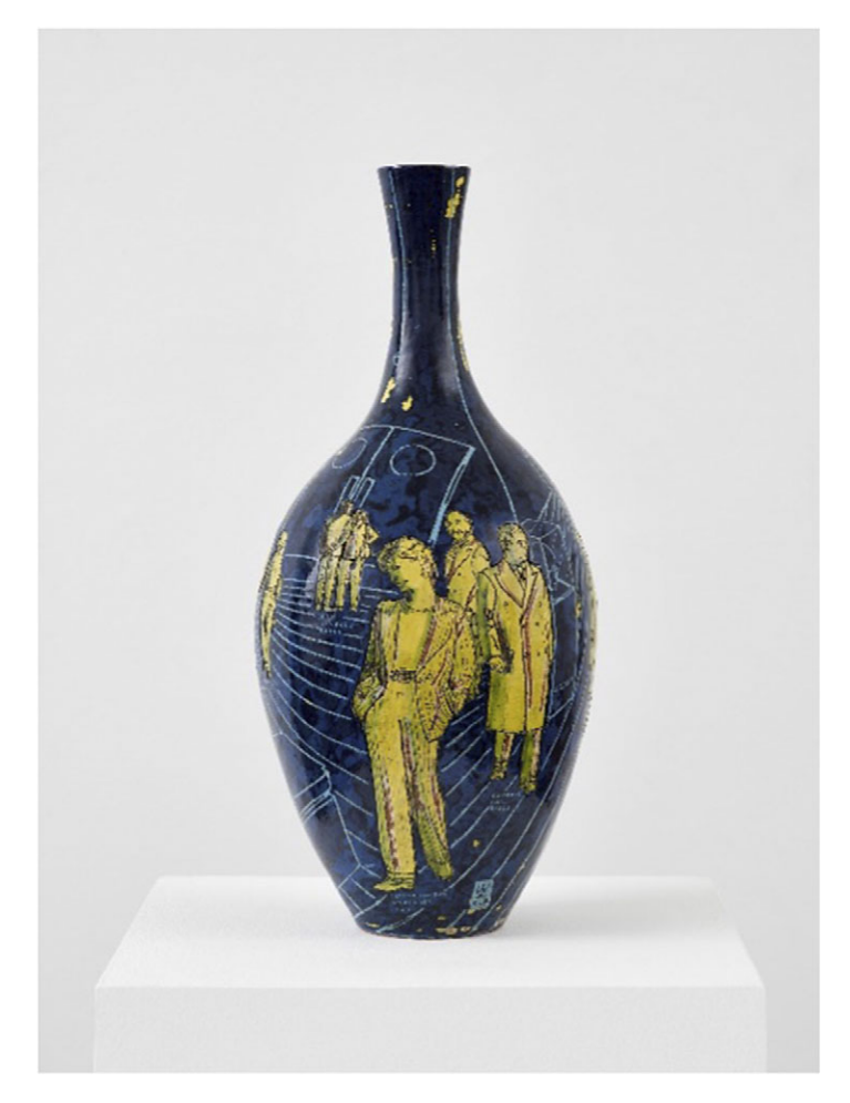
Figure 3: We Are What We Buy, 2000 Note. Photograph used with permission of the artist and Victoria Miro.

Sullivan et al. (2011) posed the question: "What is the nature of management, and what do we want it to be?," arguing that management education needs to become more interdisciplinary, to open up spaces for students: "to engage with questions of personal meaning, value, and commitment," if they are to become better leaders (Sullivan et al. 2011, 79). The main barrier to this is the dominant technical model of business, oversimplifying a world that is characterized by "complexity ... uncertainty, moral ambiguities, and conflicts of values" (Sullivan et al. 2011, 47). Five years later, and following the financial crash of 2007/8, these researchers argued more fervently for liberal learning, in the cultivation of deliberation and critical thinking; calling for "the development of humanistic education to engage the problems of our time" (Sullivan, Ehrlich, and Colby 2016, 34). This would entail learning in the service of "an empathetic understanding of others" (Sullivan, Ehrlich, and Colby 2016, 33), and a personal ethical concern, that is based upon accepting responsibility for the impact of workplace decision making (Sullivan, Ehrlich, and