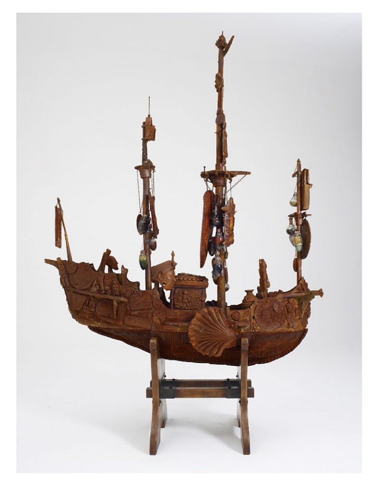
Figure 1: The Tomb of the Unknown Craftsman, 2011 Note. Photograph used with permission of the artist and Victoria Miro.

done via Perry's personal artistic journey that probes personal, social, cultural identity, and meaning. He investigates what matters to people (Sayer 2011), juxtaposing the aspirations of art against a contemporary morality of consumerism, greed, and conspicuous consumption, embracing the theme of social justice (Figure 2) in a stratified class system, and where social mobility can only work materially ( We Are What We Buy , Figure 3), and not culturally. Perry depicts a world out of balance, fueled by "casino capitalism" (Perry et al. 2023, 93) (Figure 4). The etching of Our Town is a map of Little England, "hooked on social media," with the district of Sincerity as an innocent, and vulnerable small island. Yet, he emphasizes the importance of authenticity and character, declaring "I am an artist first, not an activist," and "I never question my sincerity. I believe in everything that I make" (Perry et al. 2023, 21, 16). This sense of an authentic moral character through craftsmanship, and not corner-cutting in order to make a quick profit, is central to the contribution that can be made by business ethics, and business ethics research, in