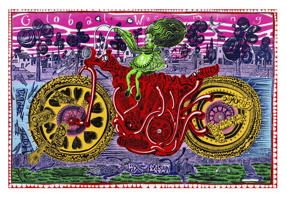
Figure 2: Selfie with Political Causes, 2018 Note. Photograph used with permission of the artist and Victoria Miro.

a higher education system where a reported 15.7 percent of UK higher education graduates admitted to cheating using essay mills, presenting others' work as their own (BBC 2021).