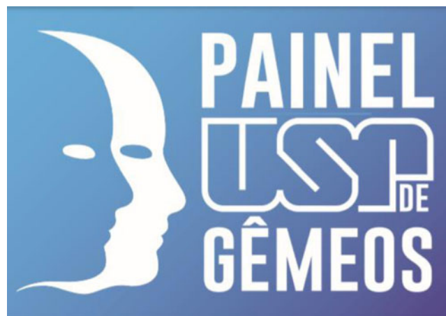
Fig. 1. Logo of the PAINEL USP de Gêmeos.

The PAINEL USP de Gêmeos takes precautions to ensure the rights of the enrolled twins. We use an online tool integrated with our website for twins' registration. Information is sent encrypted across the internet and is stored in a worksheet that can only be accessed through an account login.