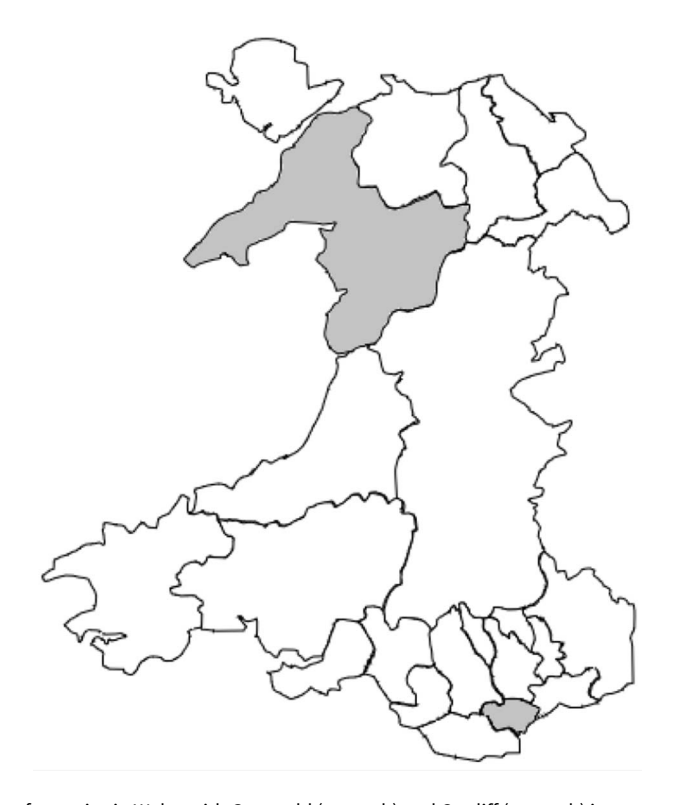
Figure 1. Map of counties in Wales with Gwynedd (at north) and Cardiff (at south) in gray.

The project targeted two areas of Wales: Gwynedd in the north and Cardiff in the south (Figure 1). Gwynedd is generally perceived to be part of the Welsh-speaking "heartlands" (Coupland, 2012), with 64% of people in the area reporting that they are able to speak Welsh (Welsh Government, 2022). Cardiff is the capital city of Wales and is a densely populated metropolitan area. The proportion of Welsh speakers in Cardiff is lower than the national average due to different patterns of language shift across Wales. The Census results for Wales showed that 18% of the country's population were