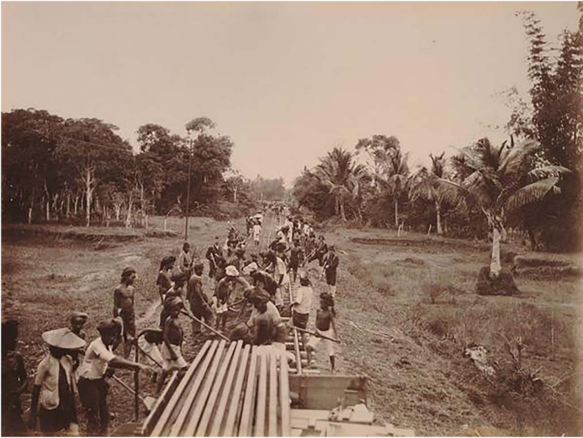
Figure 1. Forced labourers at work repairing a railway line for the Aceh tram at Meureudu on the stretch from Sigli to Samalanga. 1905.