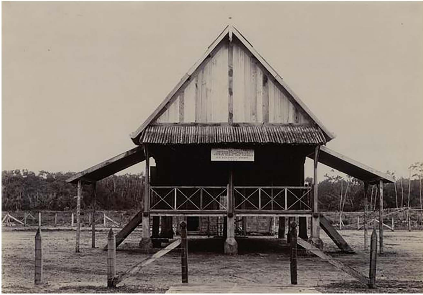
Figure 2. Accommodation in the Bengkulu residence at Seluma for berendienst conscripts from Aer Priokan. 1920. KITLV 32353. Creative Commons CC-BY License.

new colonial state further developed a refined system of mobilization of labour through compulsory labour services ( berendiensten ) in combination with the compulsory cultivation of market crops ( cultuurstelsel ). This entailed large-scale corvée by local populations, employed for plantation work, infrastructure, and public services. The simultaneous increase in corvée and convict labour was not coincidental. These forms of coerced labour were deeply connected, and their rise was related to the changing landscape of possibilities available to the colonial state in employing labour.