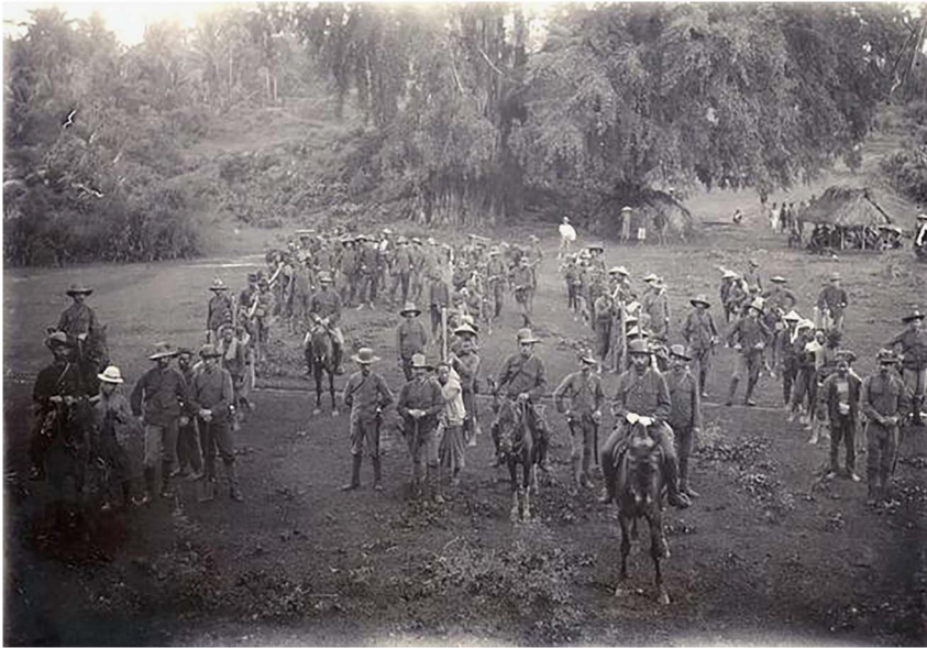
Figure 5. Transport of guns by four columns of forced labourers from Aceh, during the seventh Bali expedition. 1906.

KITLV 43219. Creative Commons CC-BY License.