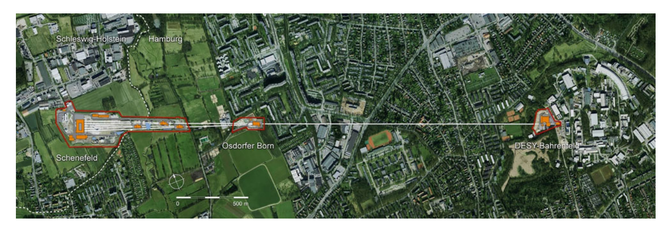
Figure 3. Layout of the European XFEL facility; the path of the underground tunnels is superimposed on a map of the northwest part of Hamburg and the town of Schenefeld in Schleswig–Holstein.