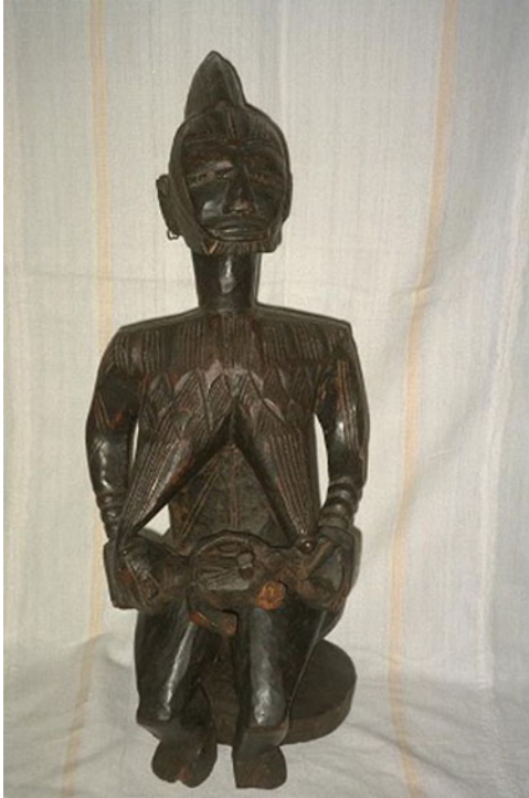
Figure 3. Eloyi mother and child figure. 31.41. Accessed 7 October 2021, webpage no longer active.

BBC contributor's accounts. Their facial smoothing indicates frequent use, making tourist manufacture unlikely, and their specificities are traceable to communities. By dint of their existence, we know two children died at birth and were held in remembrance by a family: the ibeji had a history as a soul's material embodiment before Ruxton's acquisition, a heritage his collecting rendered silent.