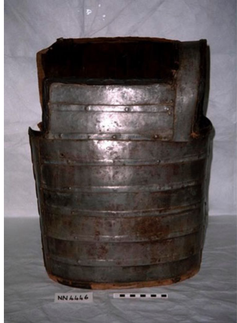
Figure 2. Cuirass. 31.134. © Horniman Museum and Gardens. Accessed 9 October 2021, https://www.horniman.ac.uk/object/31.134/ .

supplier of slaves to Sokoto [. . .] equipped with [. . .] cuirasses.” 116 Poulter argues collecting “items related to slavery helped legitimize [. . .] the perceived barbarity of African people [. . .] amongst the reasons given to justify military intervention on moral grounds.” 117 Collecting material evidence of slave-raiding expeditions legitimised Ruxton’s presence not only in West Africa but on violent campaigns, and echoed his father’s legacy.