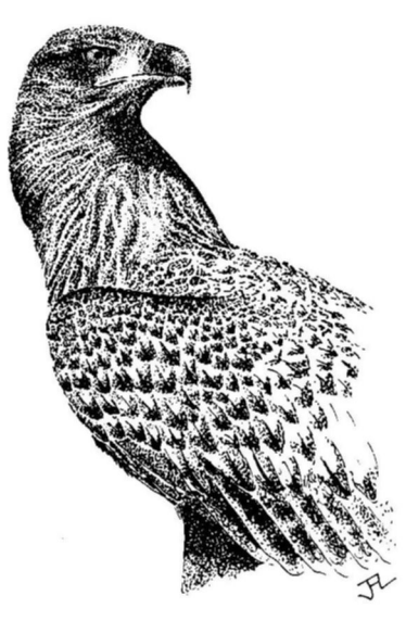
White-tailed sea eagle (John Love). Orux Vol 18 No 3