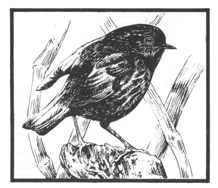
Chatham Island black robin. 174

More land for the only remaining population of the bridle nail-tailed wallaby Onychogalea fraenata is to be bought with a $200,000 contribution from the Commonwealth Government. The wallaby, which once occurred from southern Australia to north Queensland, now survives only near Dingo in central Queensland, where a 5900-ha