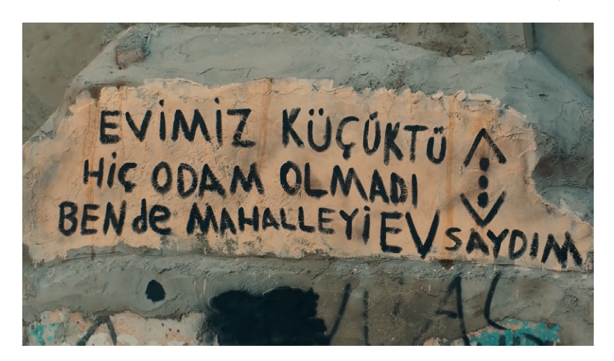
Figure 6. Graffiti.

where he is tortured to the extent that he forgets his own name. Without Yamaç, the Koçovalıs and Çukur lose their direction and dignity. Three years later, Yamaç escapes and returns as a destitute man to see new tattoo shops, scooters, new age coffee shops, and a big banner declaring "Çukur's face is changing." The giant tattoo of Çukur in front of which Selim died is almost erased.