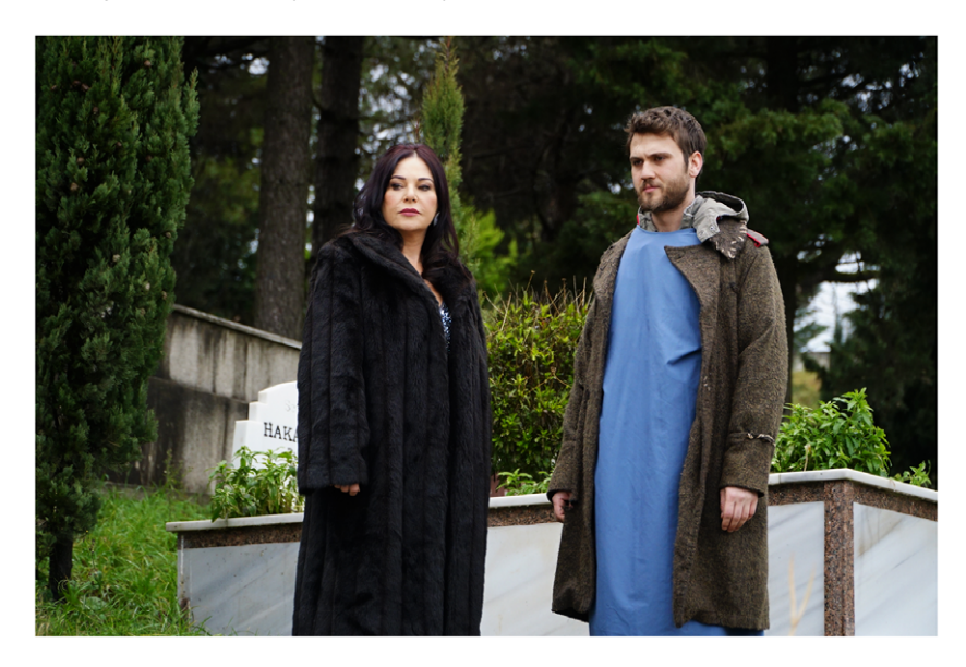
Figure 2. Yamaç's dream in the cemetery.

We didn't pardon you. Ok, but see, you're still here, lan (buddy). Your mom, dad, brothers, wife, children . . . . It seems that we all have our flaws because we do not speak up. . . . Remember you once asked me why I don't love you? It's not that I don't love you. It's just I don't love my own flaws. A man does not want to see his own flaws, let alone love them. He wants to hide the weaknesses. . . . You think it's just you that lies, and I am an honest person? You think you are scared and I am not? Don't pity yourself. You are my son. You make others listen to you. And love your flaws. The flaw belongs to you. You are the flaw (Araz da senden, araz da sensin) (Figure 3).