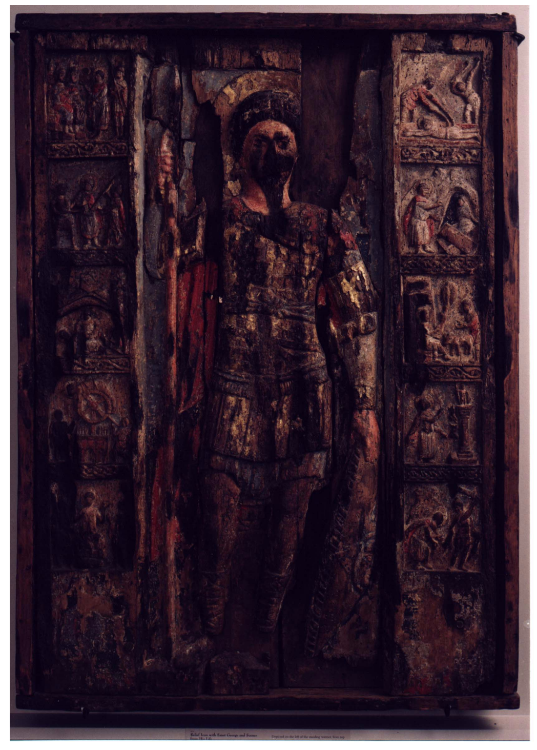
Figure 1 St George with scenes from his life