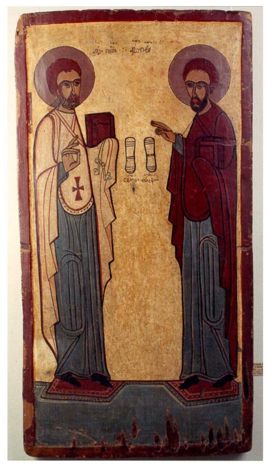
Figure 4 The Apostles Peter and Paul