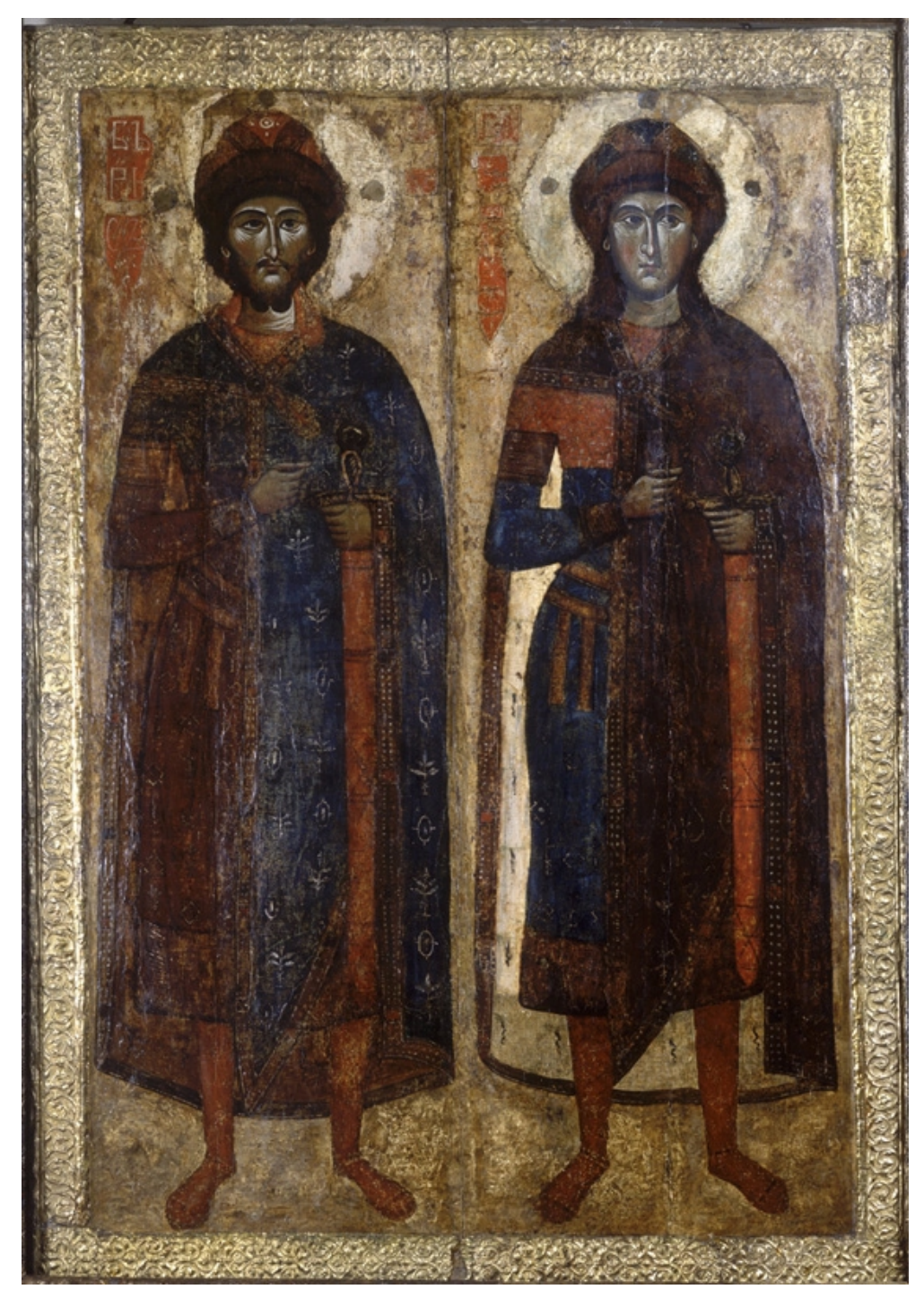
Figure 5 Boris and Gleb