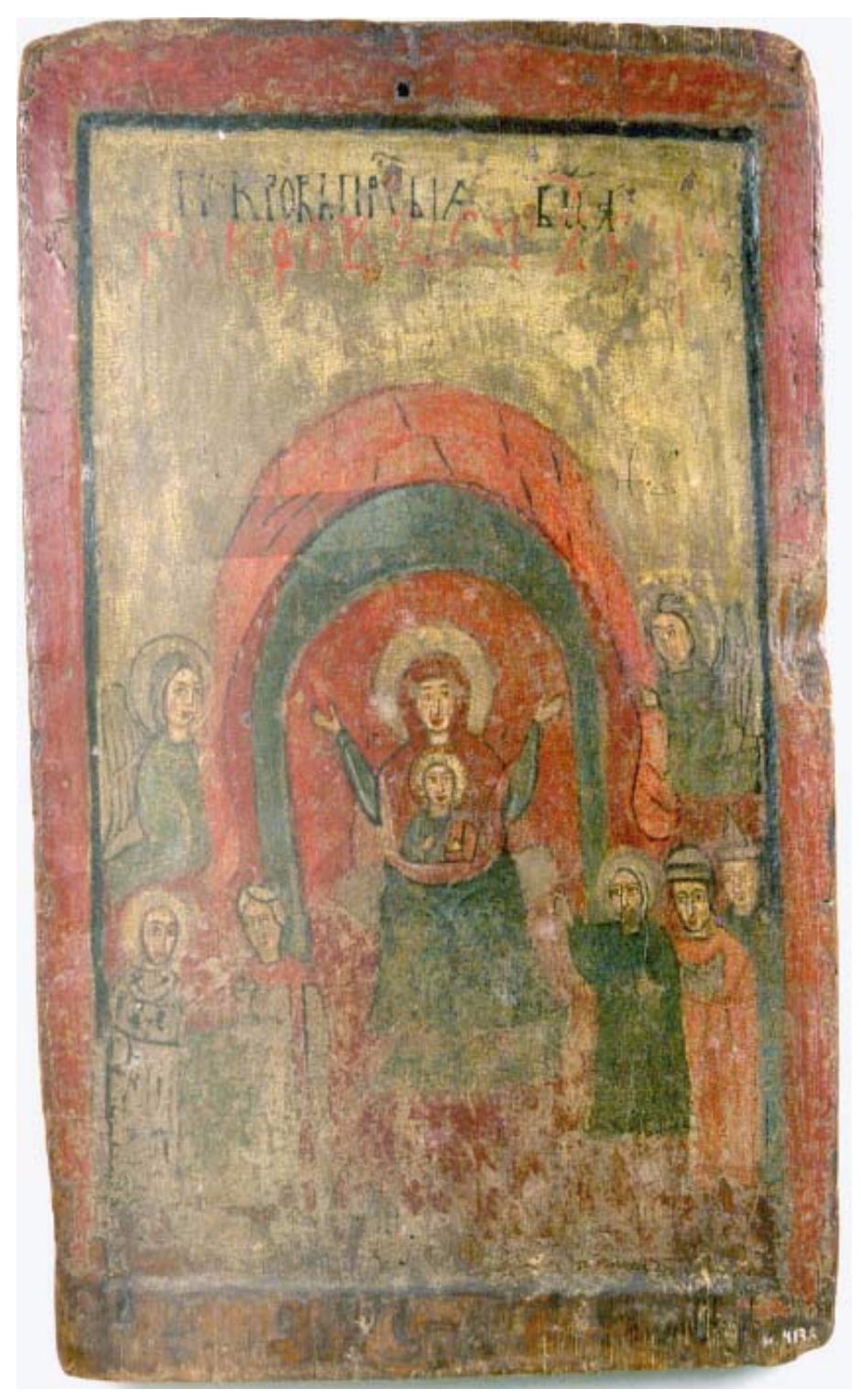
Figure 2 The Intercession