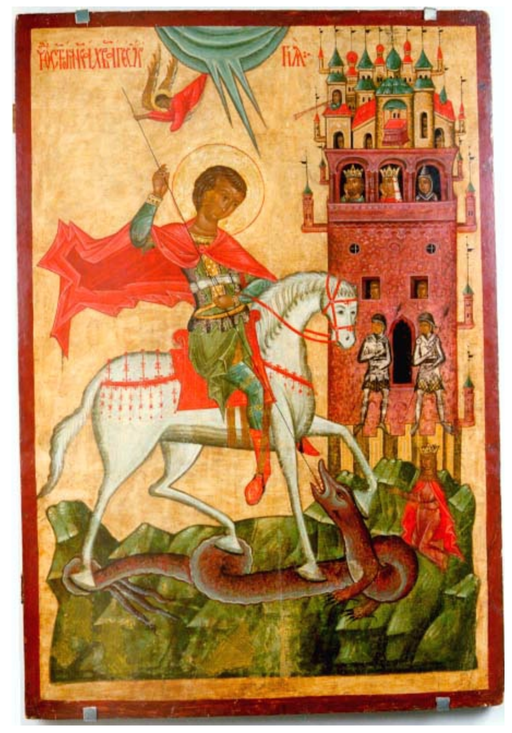
Figure 6 St George and the Dragon