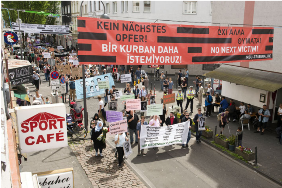
FIG. 3. The Tribunal NSU-Komplex auflösen in 2017 went from the theatre space on to the streets to demonstrate under banner 'No next victim!' in reference to the communities' 2006 protest Kein 10. Opfer .

video reinvestigated the testimony video and focused on the activities during the nine minutes and twenty-six seconds at the crime scene only, this mural captured the temporal, social and political complexity of the wider story at stake. The mural included the trial in Munich; national parliamentary inquiries; civil society, including commemoration ceremonies; protest marches; and anti-racist activism against police discrimination and the Tribunal NSU-Komplex auflösen. Cultural institutions such as documenta, and media reports with their discriminatory framing of the case's victims and relatives, were also part of it.