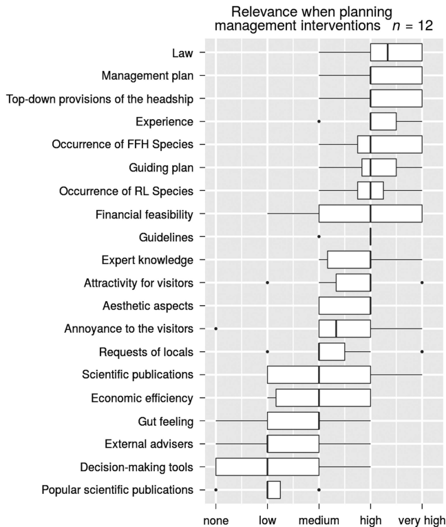
Fig. 3. Responses of national park managers asked to judge the relevance of different regulations and specifications when planning management interventions in reality. FFH Species are species that are the focus of special conservation measures declared in the EU Habitats Directive (Council Directive 92/43/EEC on the Conservation of natural habitats and of wild fauna and flora). RL Species are species that are listed in the International Union for Conservation of Nature Red List of Threatened Species. FFH = Flora–Fauna–Habitat; RL = Red List.