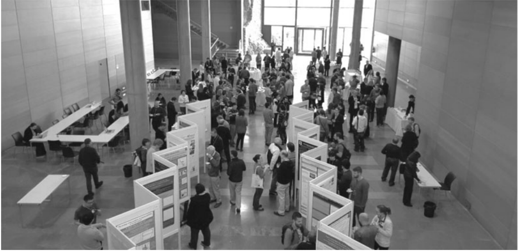
Poster viewing area at the “Zocodover space” during one of the conference coffee breaks.