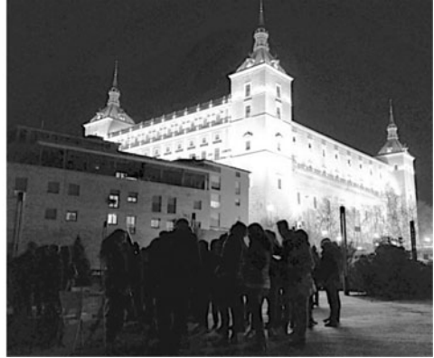
Left: ASAAF-UCM volunteers and future astronomers preparing the telescopes for the Star Party at the “Cuesta de los Capuchinos”. Right: Photograph of the “Alcázar de Toledo” taken while the public waits for the city illumination to dim.