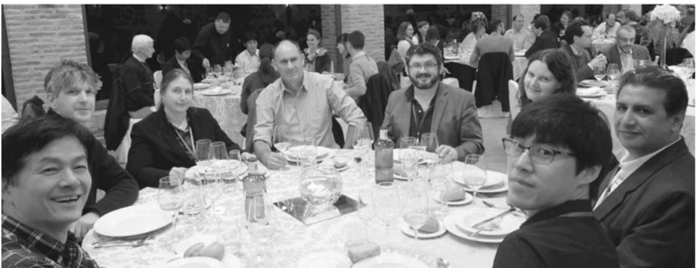
Participants enjoying the conference dinner at the “Cigarral del Ángel Custodio”.