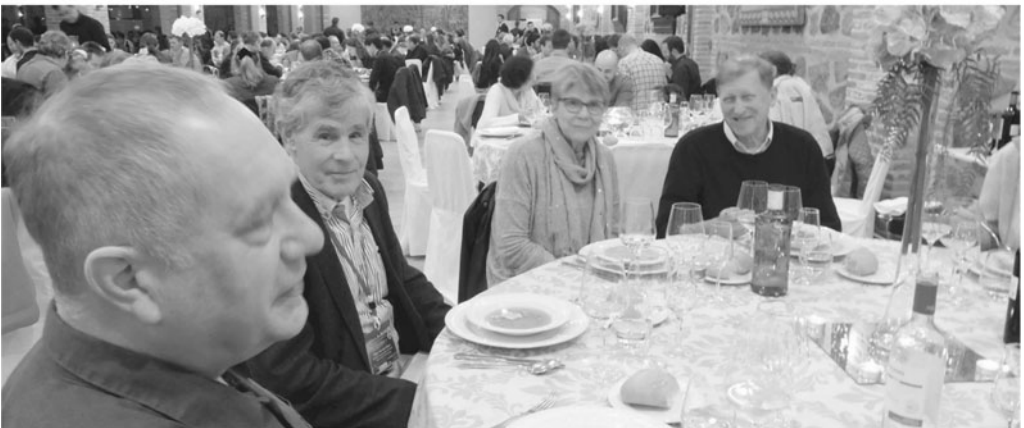
Participants enjoying the conference dinner at the “Cigarral del Ángel Custodio”.