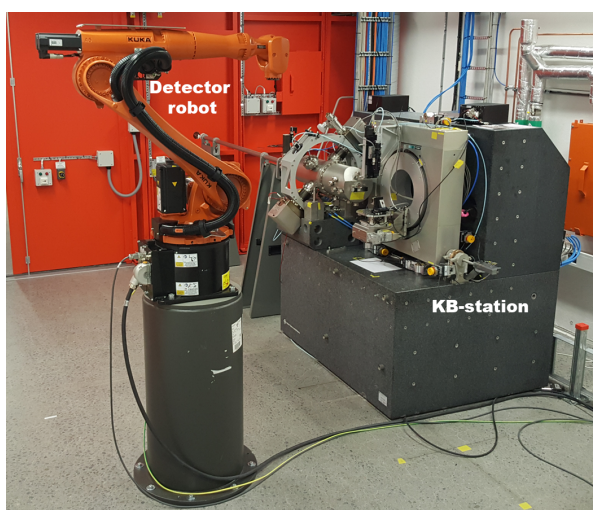
Figure. 1. Photo of the KB experimental station with the detector robot in front.