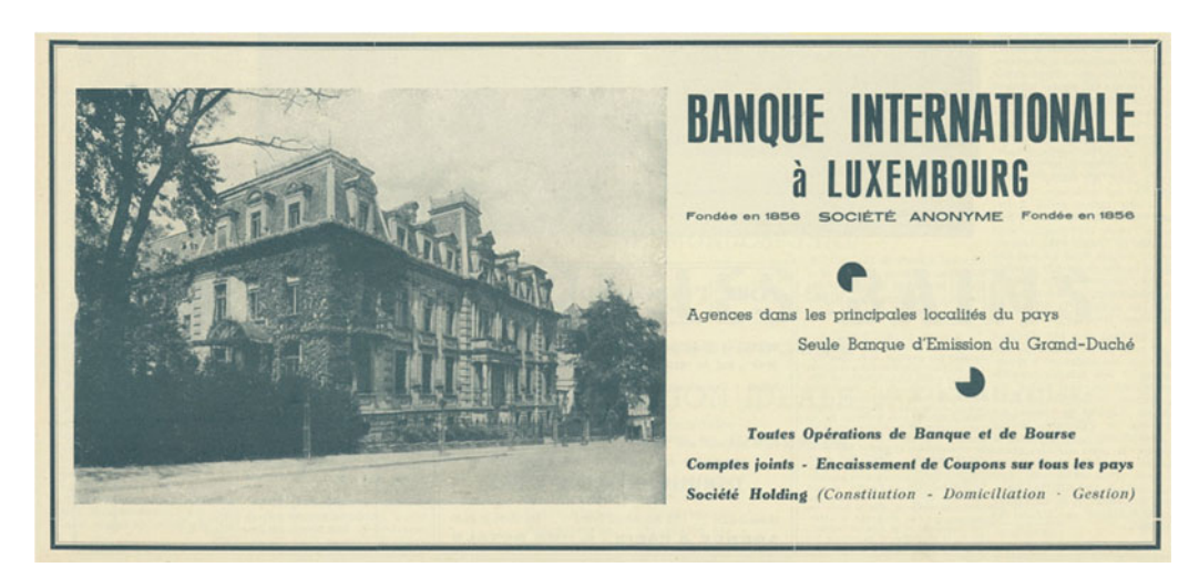
Figure 2. Touring Club Luxembourgeois 1936, Luxembourg, Imprimerie P. Linden, 1936, 109.