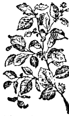
The Witch Hazel Plant.

This drug is highly commended by the British Medical Association's Committee on Therapeutics. Hazeline, being prepared from the fresh green twigs, contains all the valuable volatile principles of the plant Witch Hazel, and is much more uniform and reliable in its action than are the tinctures, fluid extracts, etc., prepared from the dried bark.