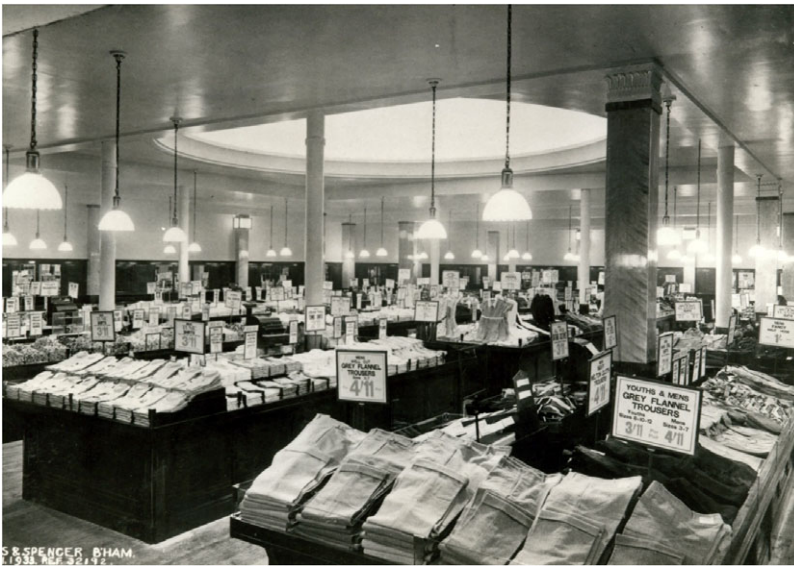
Figure 1. Open display at the M&S Birmingham store, January 1933.