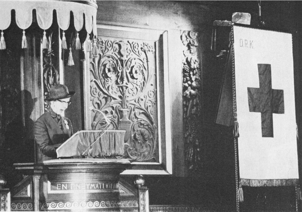
Copenhagen: The Queen Mother of Denmark speaking at the official session organized on the occasion of the Centenary of the Danish Red Cross...