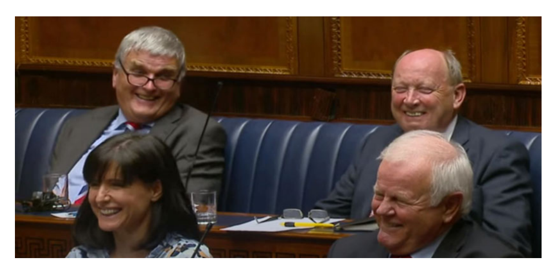
Figure 1. Ministers laugh after an intervention in the Northern Ireland assembly.

of an active notion of what visceral affect they can provoke.<sup>84</sup> Equally, and reflecting the use of video recording in ethnography, visual artefacts are valuable as they can be replayed an infinite number of times to detect the intricate 'micro-dynamics' of situations. Likewise, visual artefacts allow the observation of tones of voice, music, bodily postures, and facial expressions, as well the rhythm of an interaction (corporeal or conversational).<sup>85</sup> This is especially true vis-à-vis accessing the ecological approach's concern with the 'how' of social practices, situations, and events.