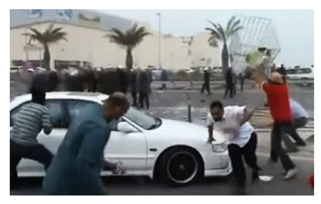
Figure 2. Bahraini protestors throw garbage at riot police during 2011 protests. Along with emotional motivations driving the situation, the material object of the garbage can can be seen to shape and direct their violent acts.

or do not combine their technological affordances with human bodies and settings in order to produce particular outcomes. For example, Bramsen drew on the sequencing of video data (alongside interviews) to show that the presence of material objects, ranging from weapons to everyday things, not only enabled but also directed the form that violence took during the 2011 Arab uprisings. Figure 2, for example, was analysed to show how what seem banal material objects – a garbage can and its contents – to encourage particular forms of violence in Bahrain, over others. Her findings there echo that of micro-sociologists in the study of domestic interpersonal violence. 99