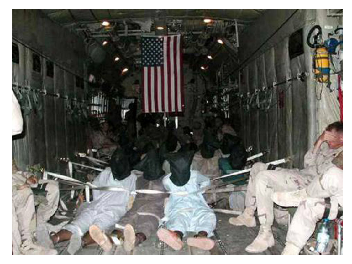
Figure 3. Photograph depicting the 'rendition' of prisoners to Guantánamo Bay by the United States, analysed by Austin and Leander, 'Visibility'.

discourses of 'abuse, sexism, racism, and homophobia'. Her argument is surely correct, but it also renders soldiers passive bodies through which these discourses flow, without grounding the reasons for the dominance of those discourses beyond their historical sedimentation. Likewise, responsibility is generally shifted to military or civilian officials who are said to be the main holders of the requisite agentic power to shift such an 'internal military culture' and hence those who must principally be targeted by counter-normative entrepreneurs seeking to shift the internalised nature of these norms.