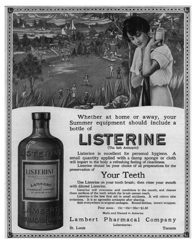
FIGURE 12.1 A 1915 advertisement for Listerine.

There is nothing in this contract to indicate that plaintiff's predecessors bargained for more than the disclosure of the Lawrence formula which was then unknown to it. Plaintiff has pointed to no principle of law or equity which would require or permit the court gratuitously to rewrite the contract which its predecessors made for these considerations.