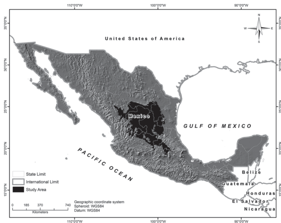
Figure 1. Location of the modelled area. The black region corresponds to the 'Meseta Central Matorral' (MCM), delimited as 'M' according to Soberón and Nakamura (2009).