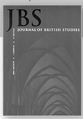
Journal of British Studies http://journals.cambridge.org/jbr