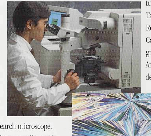
FT-IR microspectroscopy can be used to determine crystal polymorphism, which impacts the drug's solubility and therefore the product quality and activity.

No problem is too small! Our staff of microscopy experts will help you achieve the best results possible. Contact us for more information.