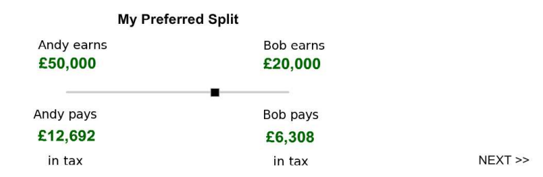
Figure 1: Screenshot from the Experiment. In this case the taxation situation was described in terms of tax paid, not residual income, and amount, not percentage.

Please click on the grey line below and move the slider to indicate what you think is the best split. The slider is calibrated so that the total amount of tax collected from the two of them verall is always the same.