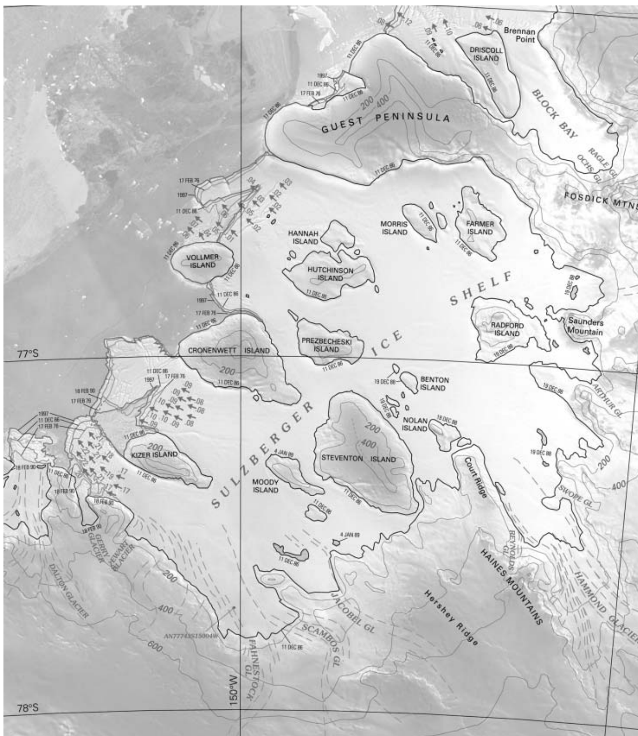
Fig. 2. Section of the USGS Geologic Investigations Map I-2600-G, Coastal Change and Glaciological Map of the Saunders Coast area, Antarctica, showing the Sulzberger Ice Shelf area. The multicolor map, reproduced here in black and white, shows the change in position of the ice front from the 1970s to 1997 and the location and amount of measured ice-surface velocities in \text{km a}^{-1} . The grounding line has been interpreted from Landsat imagery. In this area the ice front has shown slow, continuous advance with little to no calving. The original scale of the map is 1 : 1 000 000. The map section is approximately 190 km \times 225 km. The background image is the RADARSAT mosaic.

Stream range from 20 to 170 \text{m a}^{-1} , and those of Kiel Glacier (Prestrud Inlet) range from 20 to 180 \text{m a}^{-1} .