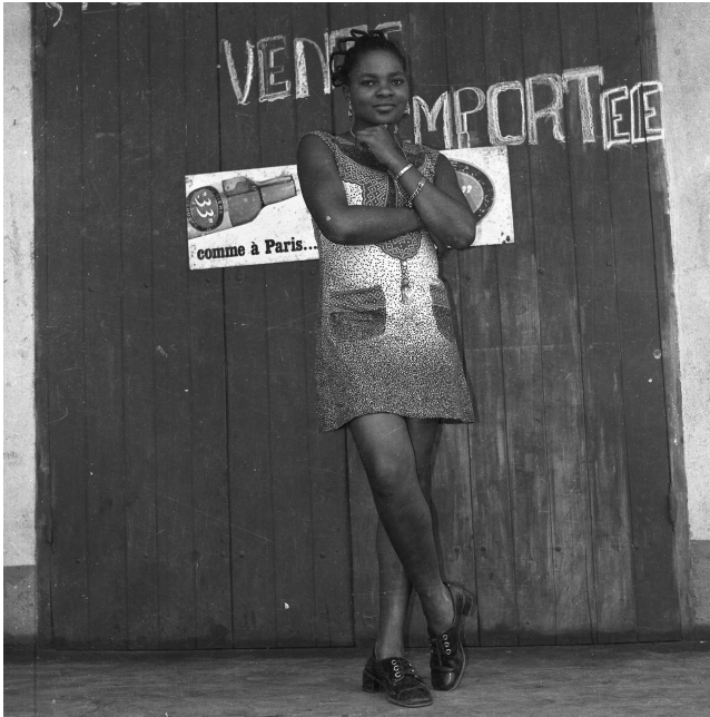
Figure 8. Detail, Comme à Paris . EAP054_I_182_383.