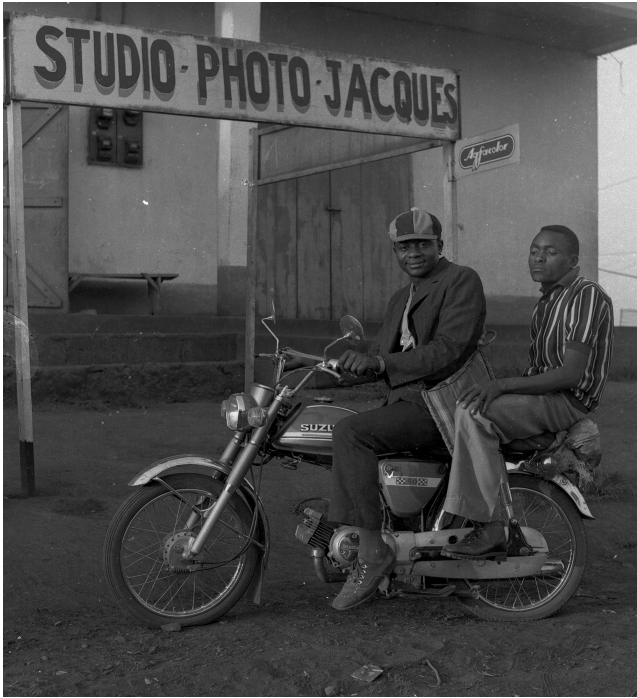
Figure 2. Studio Photo Jacques in Mbouda, c.1975–80. EAP054_I_125_181.

preceded independence and the introduction of identity cards with photographs (in about 1955; see below). The latter requirement brought into being a widespread network of photographers throughout Cameroon (Zeitlyn 2019).