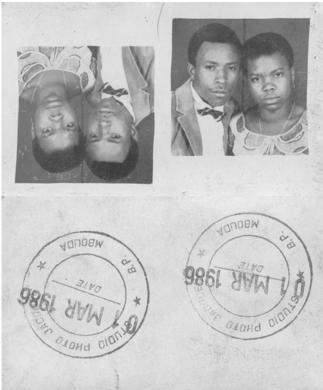
Figure 6. Photograph for a marriage certificate, 1 March 1986. EAP054_I_96_78.

When Cameroonian citizens went to a local studio photographer to have photographs taken for their national identity cards, they were literally inscribing themselves into the nation state. 26 As has been mentioned, the representation was at times changed post-mortem: the children of the deceased would often take the ID cards to another photographer (or an anthropologist) to have the photograph copied for display on the wall – it was often the only image of a deceased parent or grandparent. But uses changed before that: a photograph made for a civil marriage certificate would sometimes be put in an album or a large copy printed for display on the wall. Once taken, these images have different lives of their own. Once the negative exists in the photographer's archive, and if spare prints are held by individuals, then for all their role in state bureaucracies, the images may have a life beyond their bureaucratic uses. 27 The social lives of photographs are even more complicated than those of other things, since they are often multiple: in the case of a photograph taken for a marriage certificate (see Figure 6), the image may have many different lives in