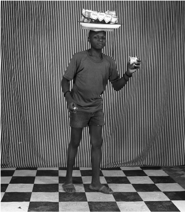
Figure 4. A street seller. EAP054_I_54_58.

than two people – as well as photographs of babies. I note that there are almost as many images of road traffic accidents (191) as there are of (Christian or civil 14 ) weddings (212). There is also a small number of images taken in hospital showing bandaged patients recovering after surgery. 15 I have done such counts with other Cameroonian contemporaries of Toussele, and the relative percentages are similar. 16