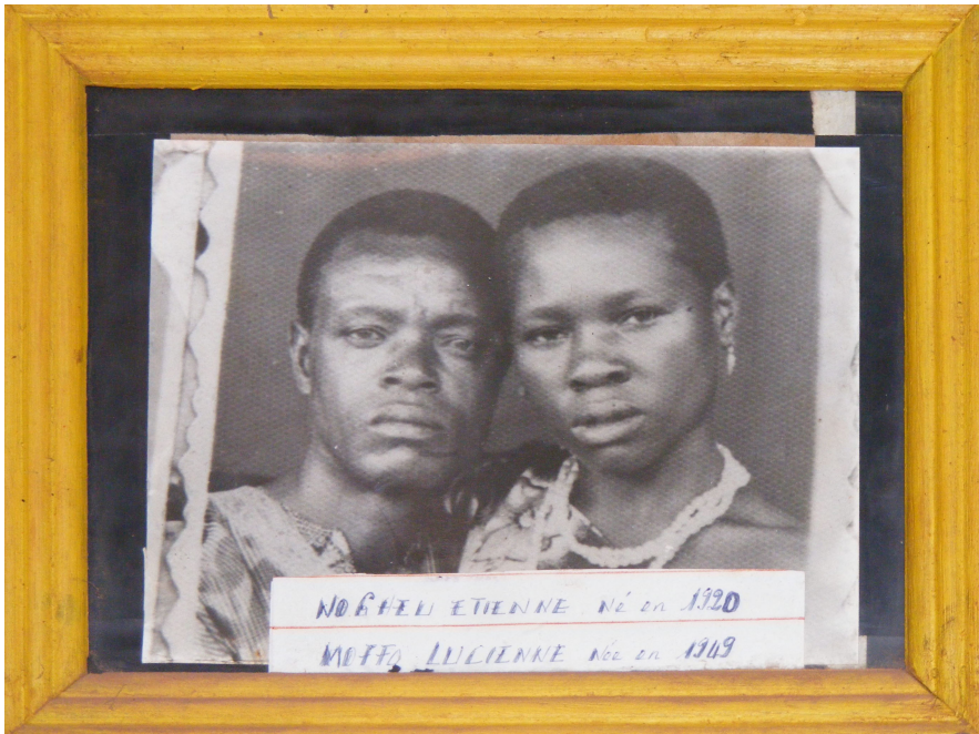
Figure 7. A framed and captioned marriage certificate photograph on the wall of a house.

parallel (what happened in the 1960s continues in the 2010s and 2020s). One copy lives in the administrative archives, stapled to the official register copy of the marriage certificate, a duplicate of which will be held by the couple possibly along with the large print on display as already mentioned (see Figure 7), alongside or instead of photographs of church weddings. In some cases, homemade Christmas cards are made in which the couple (represented by the marriage certificate photograph) are surrounded by photographs of their children.