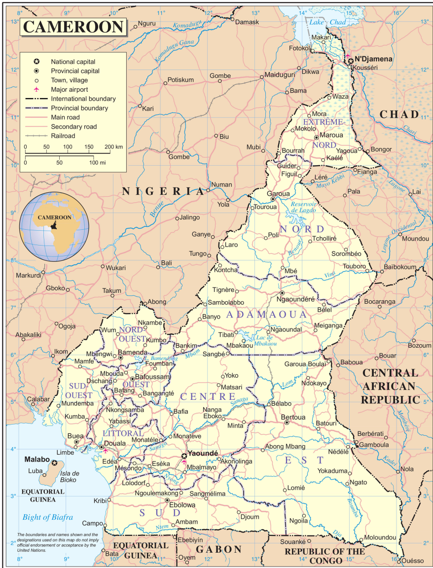
Figure 1. Cameroon (Mbouda is between Bamenda and Bafoussam).