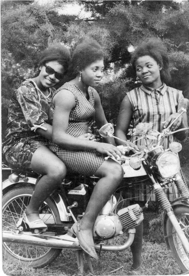
Figure 9. Posing with the photographer's motorbike. This image was used as an example on display in the studio. EAP054_1_111_20.