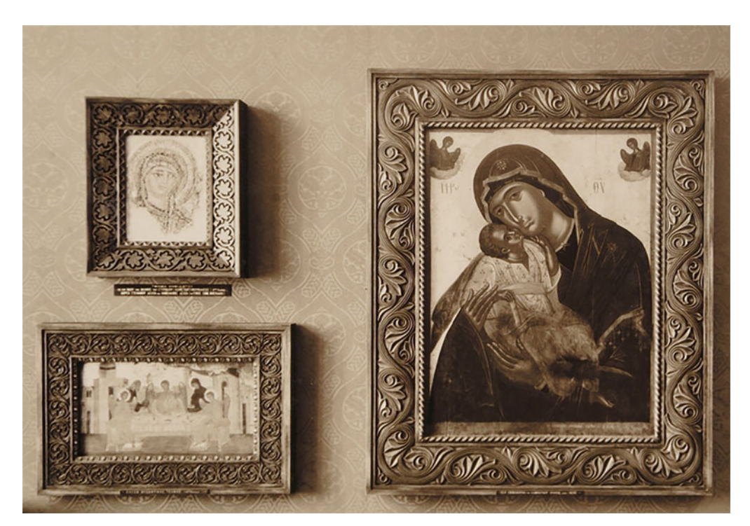
Fig. 7. Benaki Museum (1931), Display of icons in Room \Gamma .

collector, but also with the strategy of promoting icons, particularly Cretan icons, on equal terms in the historiography of European art. At the same time, by setting the icons in new frames Benakis, as a collector, completed the process of appropriation, setting on them his personal stamp. Perhaps nowhere is this more evident than in the Adoration of the Magi by Domenikos Theotokopoulos (El Greco), where the rare original frame was removed (and thankfully kept in storage), to be replaced by a new one, similar to the others. (Fig. 8a-b) The bold presence of the new frames Benakis used for the display of icons and textiles, with their individuality and artistry, almost create a counterpart to the works themselves. No longer simply a parergon –as defined in the philosophical dialogue on frames between Kant and Derrida–<sup>67</sup> these frames make their own meaningful statement bridging the medieval and the modern, and eloquently express preoccupations and perceptions of Benakis' own day.<sup>68</sup> At the same time, by framing