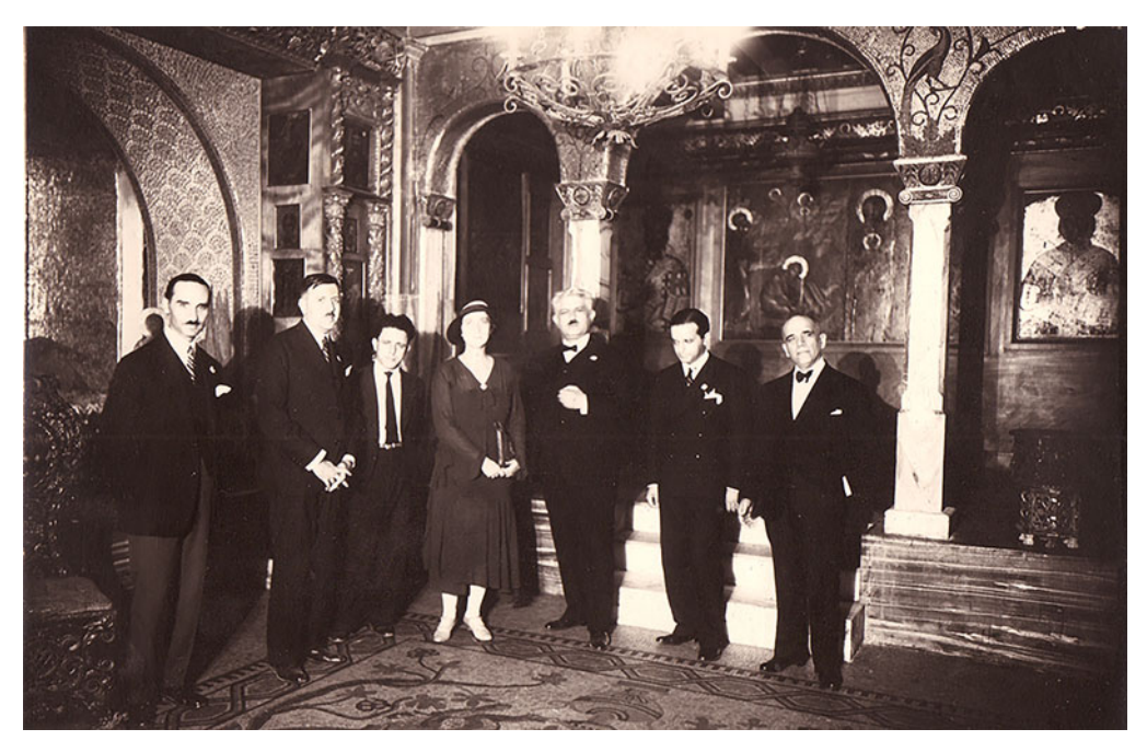
Fig. 6. The Loverdos Museum (1930), Ground Floor (After Gratziou and Lazaridou, Από τη χριστιανική συλλογή, 371, fig. 697).