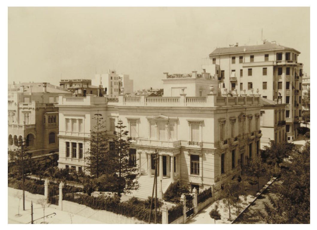
Fig. 2. The Benaki Museum (1931).

the most promising field of enquiry: it is well known that Benakis was wholeheartedly dedicated to the new museum and personally supervised every aspect of the enterprise, from the extensive refurbishment and expansion of the building in order to convert it from a residence into a museum, to the display cases, wallpapers, mounts, and minutiae of the decoration, furnishings and equipment.