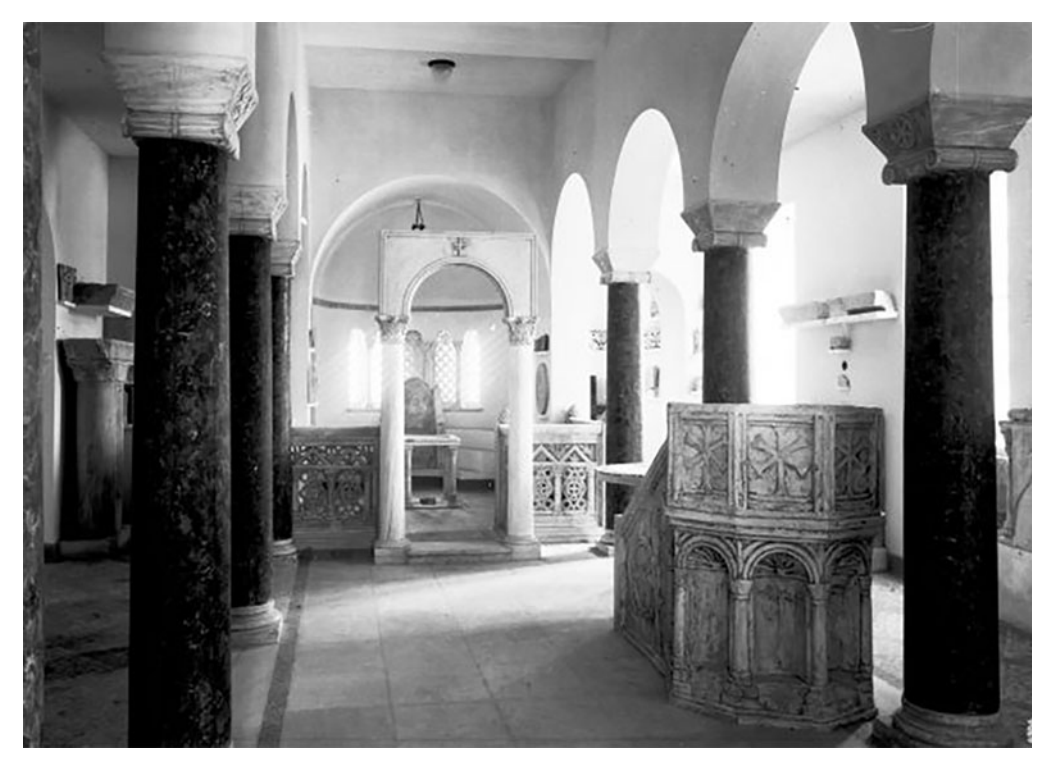
Fig. 5. The Byzantine and Christian Museum of Athens, 1930, Room A, Reconstruction of an Early Christian Basilica.