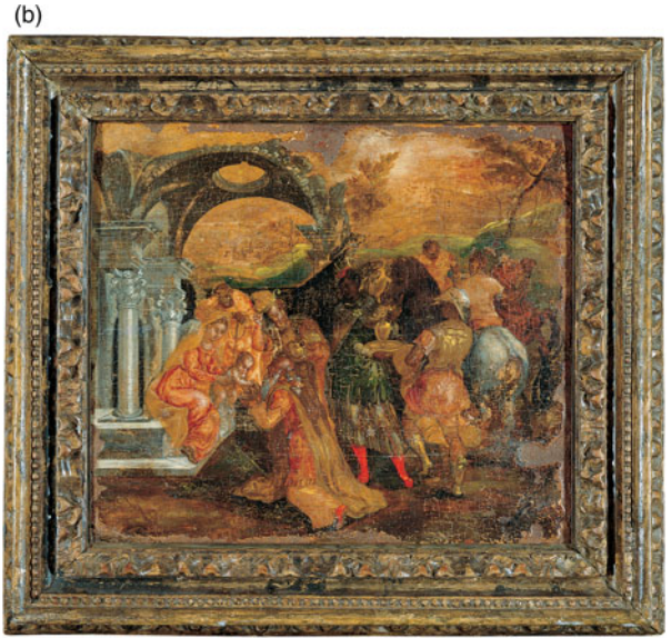
Fig. 8a. The Adoration of the Magi by Domenikos Theotokopoulos, set in a frame designed by Antonis Benakis (1931). Fig 8b: The Adoration of the Magi by Domenikos Theotokopoulos in its original frame.

parts of mosaics and textiles or sections of larger panel compositions, Benakis highlighted them as autonomous, self-contained artistic units. He created entities out of snippets.