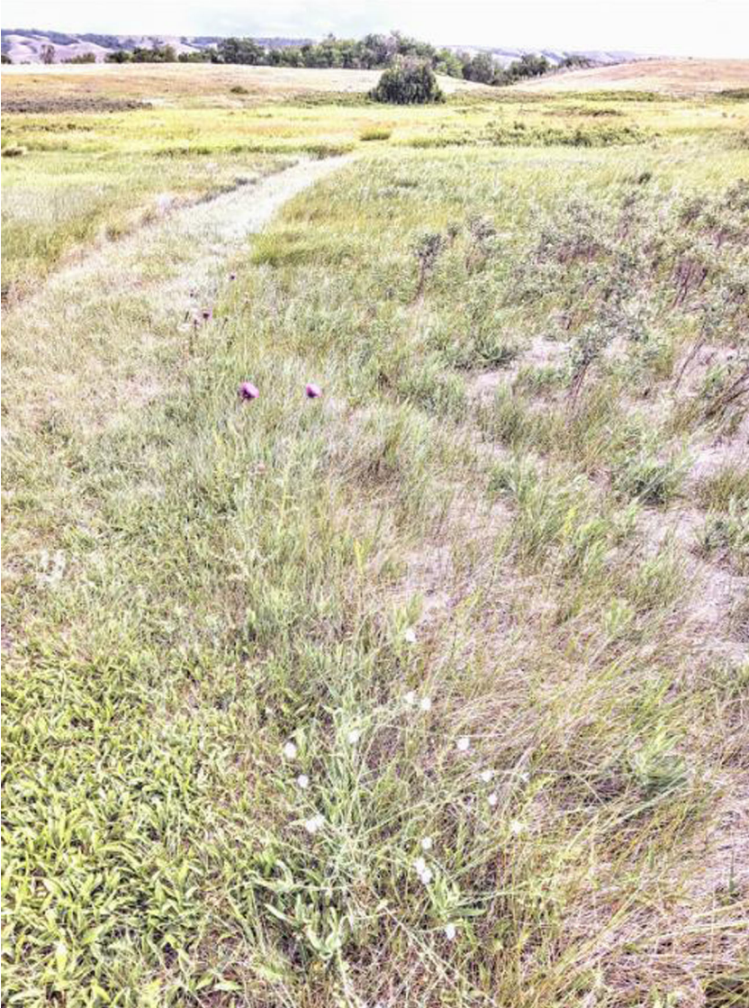
Figure 10. Bison shimmers.

Here at Buffalo Pound Provincial Park, like many P/places across the North American prairies, we dwelled with ghostly necropolitics (Mbembé & Meintjes, 2003; Mbembé, 2008); living at the juncture of contemporary social and ecological P/place(s) implicated by settler colonialism and government sovereignty that continues to fuel society's negative passions that justify Indigenous erasure on stolen lands (Belcourt, 2015; Braidotti, 2013; Mamers, 2019). However, as Barad (2017) reminds us, "Loss is not absence but a marked presence, or rather a marking that troubles the divide between absence and presence" (p. 106). Or for Rose (2017), "Indeed, for power to come forth, it must recede. For shimmer to capture the eye [see Figure 10], there must be an absence of shimmer. To understand how absence brings forth, it must be understood not as lack but as potential" (pp. 54–55). Through knottings of past~present~futures, we move within the tensions of life and extinction, as difference casts a shimmering of what once was, what now is, and what might be (Bubandt, 2017; Malone, Logan, Siegel, Regalado & Wade-Leeuwen 2020). It is the spirit