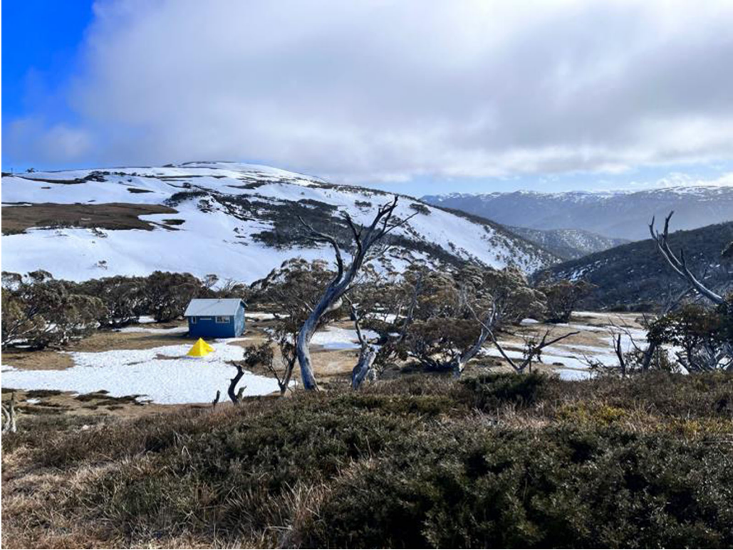
Figure 1. Questionable backcountry skiing conditions in late Winter, 2023. (Jaithmathang Country).