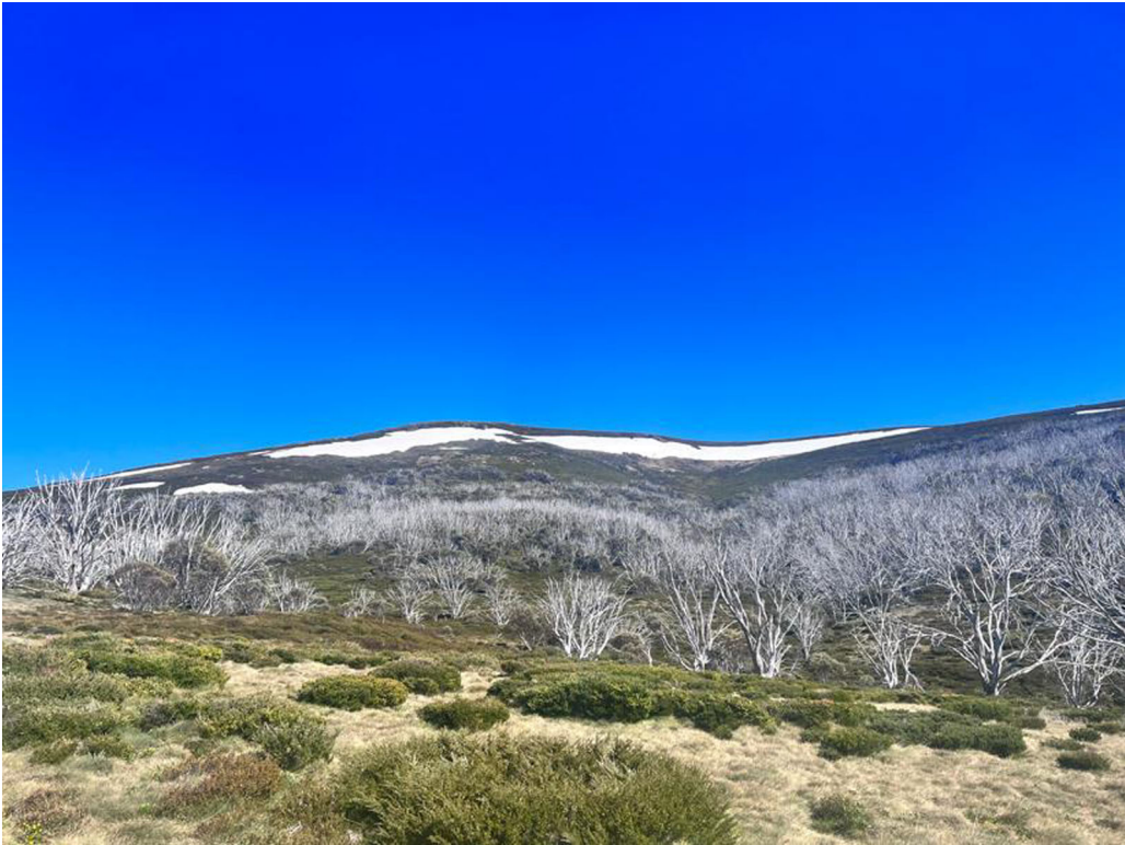
Figure 4. A snow patch and recovering snow gums under Mount Nelse (Jaithmathang Country).

The same also goes for surrounding shrubbery, leaving ghost forests, invasive grasses and a landscape less able to retain snow. Possibly worst of all, is that in these particular forests, with these types of trees, older forests produce less fire, but more fire leads to more fire (Zylstra, 2013). Rose's (2012) concept of double death resonates here, where it is not just death of an individual, but also death of ongoingness and the ability for an ecological collective to regenerate itself.