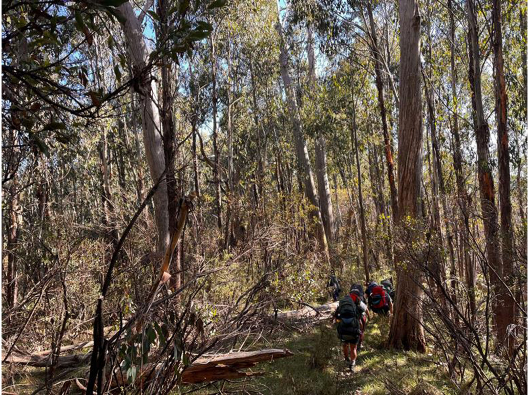
Figure 5. Dense regrowth of Alpine Ash — a more fire prone landscape (Jaithmathang Country).

wetlands in this case). Worldviews collide when the Alps are considered. Many people value the Alps, but for different reasons; commodity, resource, wilderness, recreational amenity, home, kinscape and much more. The Alps are a boiling pot, mixing together biological processes and enduring material manifestations of colonial and capitalist pressures, all with a natural facade. But there is hope in these mountains, too, with people caring, acting and fighting for them in numerous ways (e.g., passionate activists, land managers, fire fighters, educators and more, performing little acts of care every day).