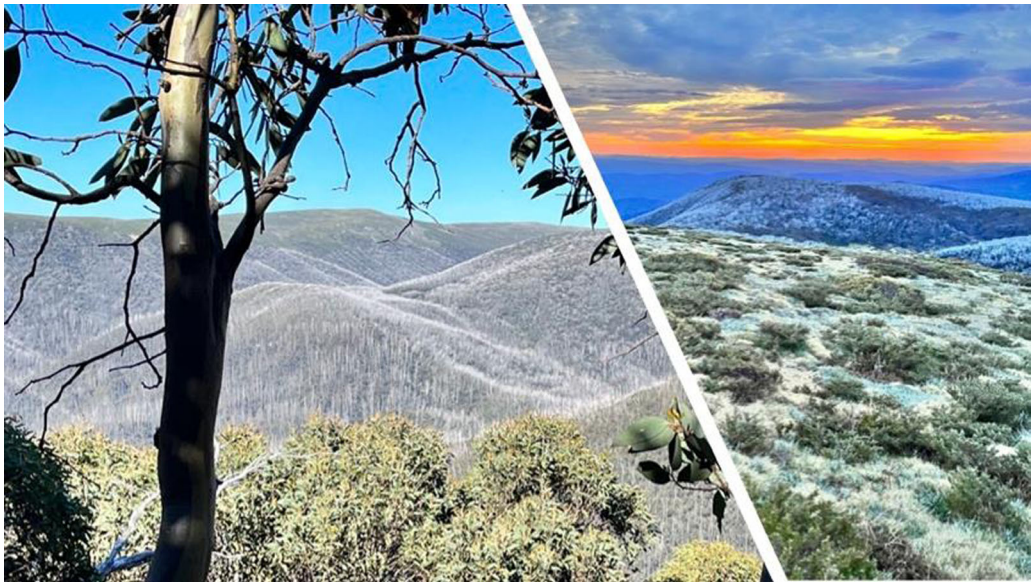
Figure 3. Snow gums near Mount Bogong/Warkwoolowler burned in the 2003 fires (right) and looking eastward from near Falls Creek (left). (Jaithmathang Country).

because, although snow gums have adapted to fire, they are not well adapted to multiple fires in quick succession. As Fairman et al. (2017) explain, snow gum limbs will often die in a fire, but they regrow from lignotubers (their bulbous bases where energy reserves are kept and where buds lie dormant), starting again with small shoots (e.g. see Figure 4). However, multiple fires in quick succession kill off lignotuberous growth, ultimately killing the tree. Furthering this issue, new seedlings may regenerate after one fire, but are killed off after multiple fires in quick succession.