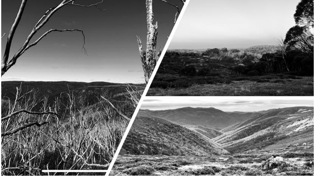
Figure 2. 'Ghost forests' across the Australian Alps. (Jaithmathang Country).