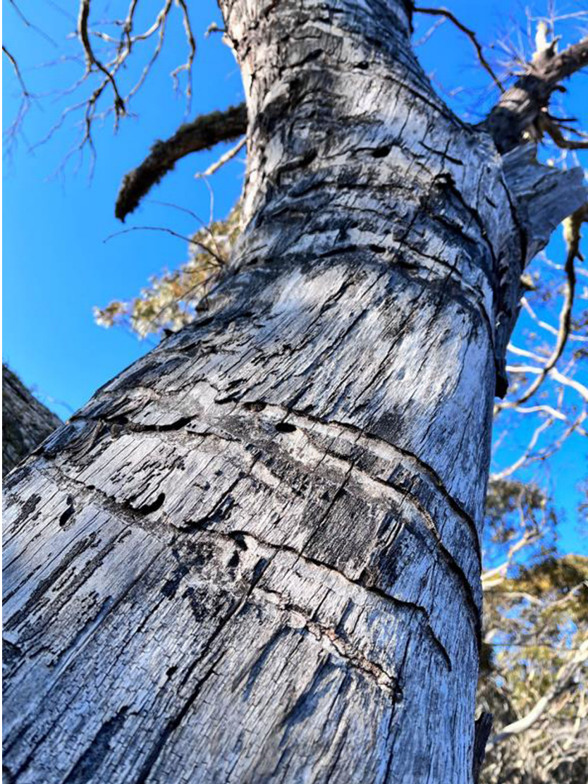
Figure 7. Snow gum dieback (Jaithmathang Country).

them” (p. 7). Correspondence (the action of reading and receiving) seemed an apt way of describing our relationship with the tree, as we enjoyed its shade, rested and conversed. As a group, we discussed the fate of the snow gums, impacts of fire and changing climate. This was an ongoing discussion from the onset of the trip, which continued throughout (and which I hope endures). “I get why we come out here for such a long time now”, mentioned a student later in the journey. As we discussed, it takes time to shift attention from home, just as it takes time to become immersed in the present, and it takes time to develop a bond with a Place — to have its story seep into yours. The duration of the trip, the duration of the landscapes enduring more-than-human characters, ghost forests, spectres of past fires and colonialist memories trickled into, through and extended awareness, dissolving individual humanist borders.