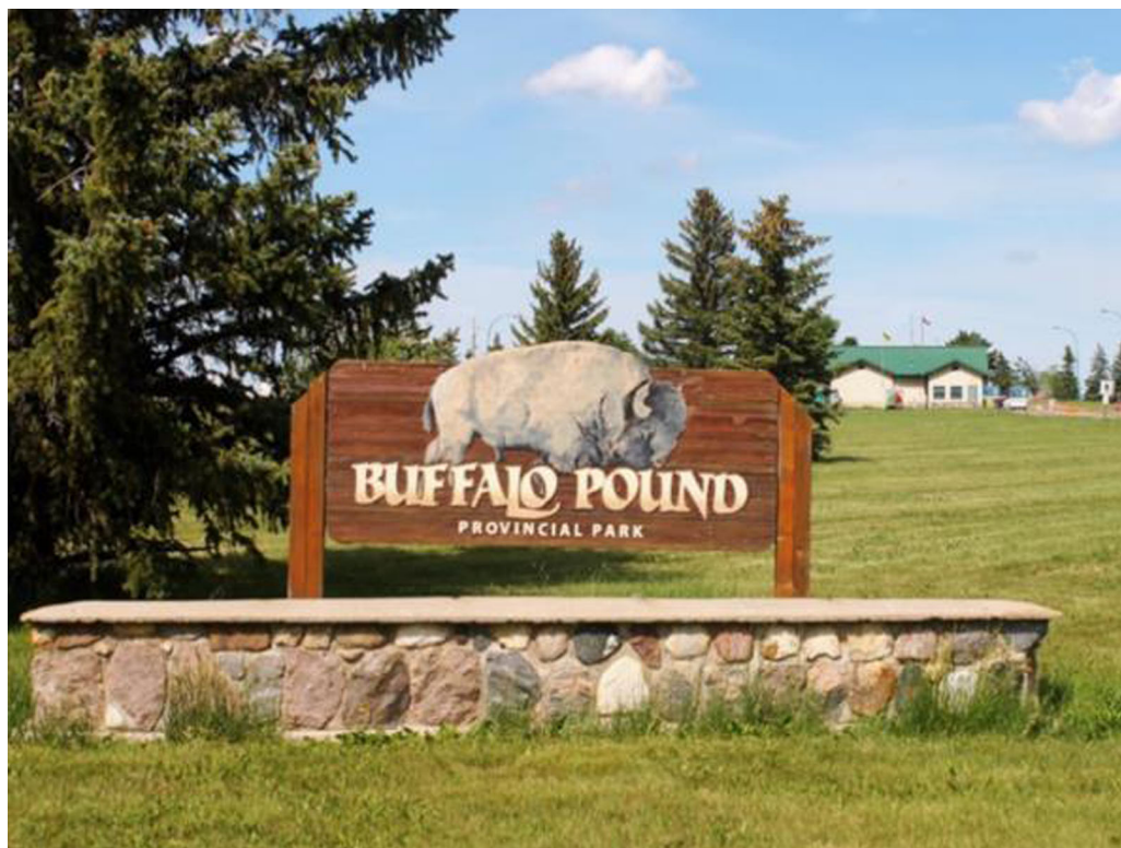
Figure 8. Bison signs.