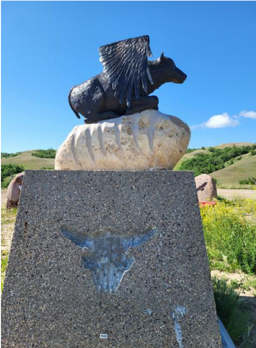
Figure 9. Bison ghosts.

landscape, or their gentle grazing amongst tall prairie grasses alongside the cultural practices of the Cree, Dakota, Dené, Lakota and Saulteaux First Nations of Saskatchewan, were not commensurate with the bustle of Canada-Day fanfare.