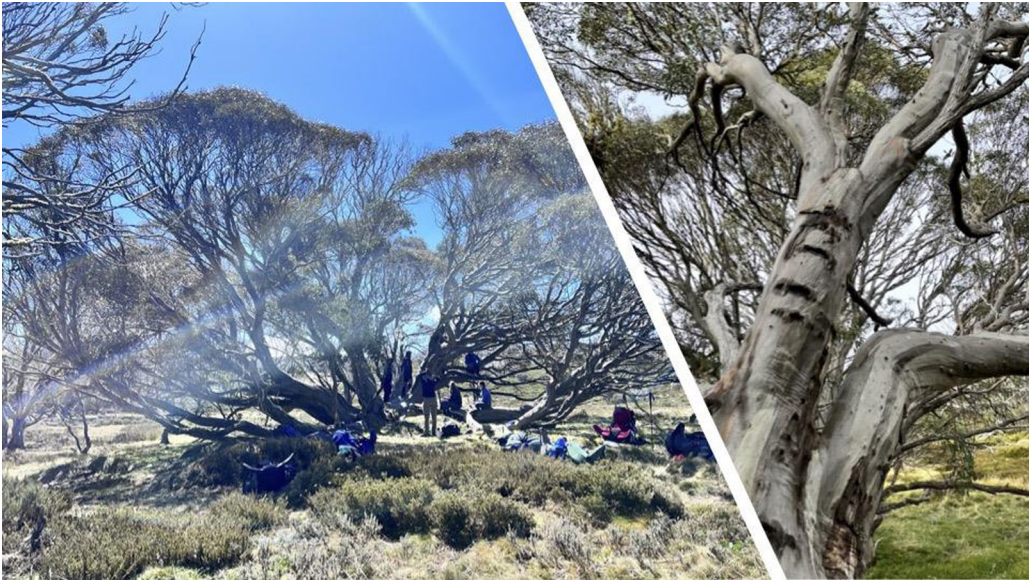
Figure 6. The octopus tree — an ancient tree fighting a new challenge.. the longicorn beetle (Jaithmathang Country).