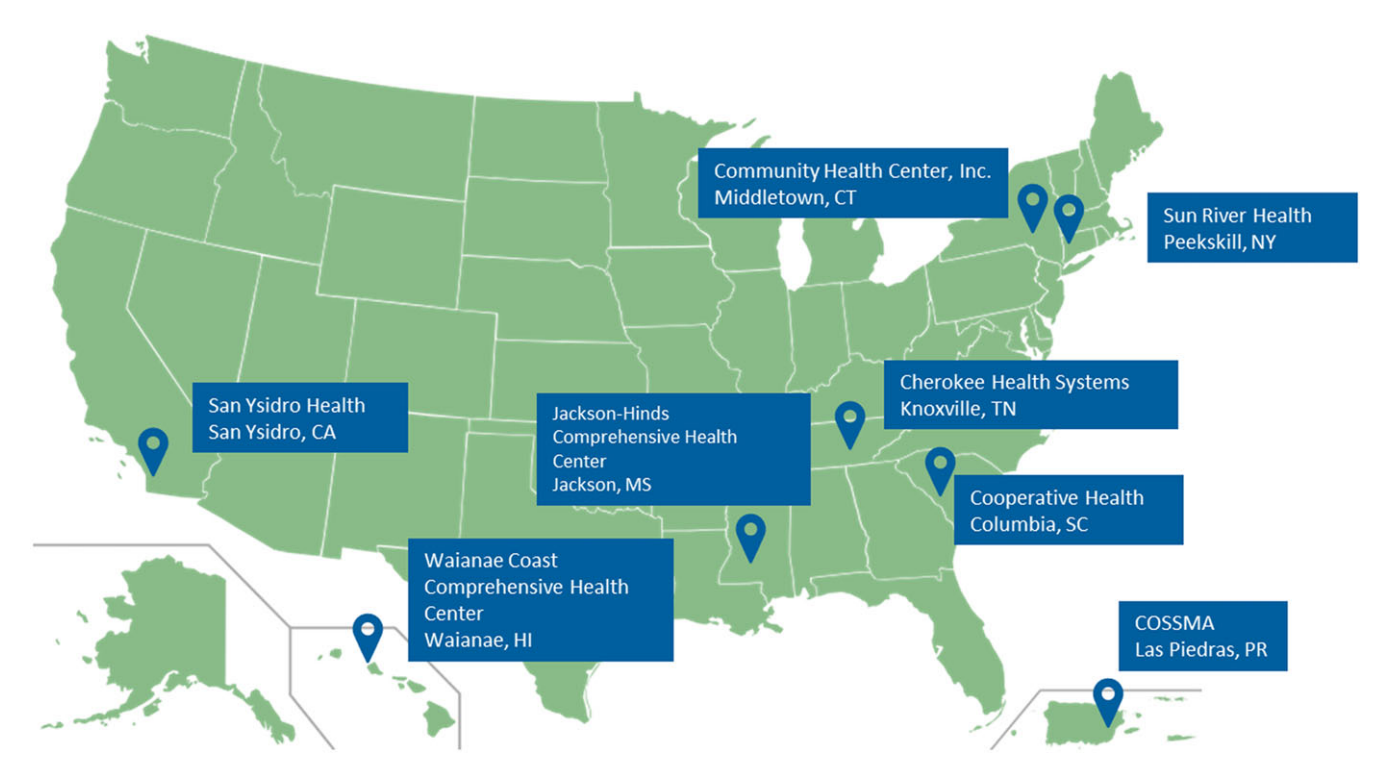
Figure 1. Federally Qualified Health Centers (FQHCs) supported by Central Coordination in the All of Us Research Program.

resources developed included a repository of job aids and other tools and a set of training to educate staff on terminology as well as equip them to answer potential questions from participants. To promote sustainability, Central Coordination partnered with the FQHCs to design "train the trainer" sessions, which built capacity for health center staff locally to implement learning opportunities that increased the self-efficacy of their teams to address genomics-related questions from participants. With the support of Central Coordination, the FQHC working group provided training in foundational genomics material to over 50 FQHC staff (approximately half of all FQHC personnel), trained 14 FQHC staff to become trainers, and created over two dozen resources. Later, some FQHCs created additional resources in Spanish.