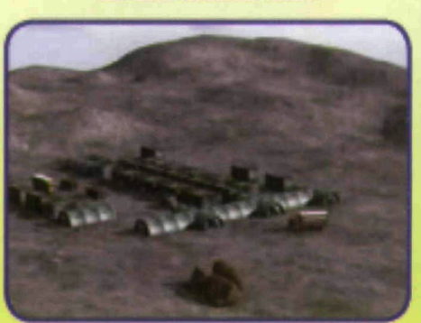
Norlense inflatable tents