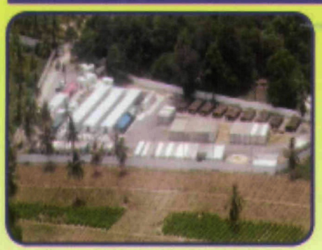
Thai Tsunami Victim Identification Centre