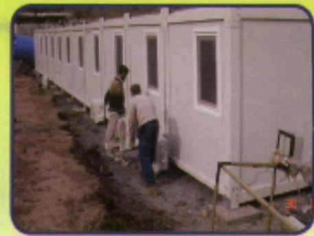
MSF Hospital, Hattian Bala, Pakistan