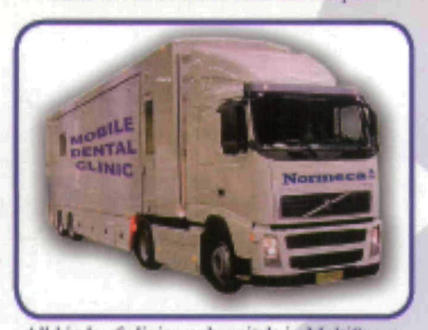
All kinds of clinics or hospitals in MultiSpace