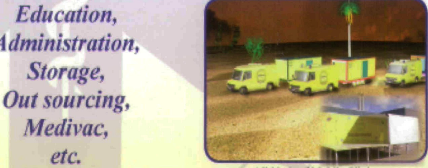
All kinds of Mobile Clinics