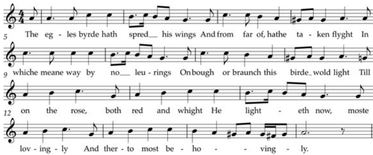
Figure 1. John Heywood, A Balade specifienge partly the maner, partly the matter, in the most excellent meetyng and lyke mariage betwene our Soueraigne Lord, and our Soueraigne Lady, the Kynges and Queenes highnes (London, 1554), set to 'Pastyme with good companye'.

eight lines. The eight-bar melody 'Donkin Dargeson', for example, suits stanzas of four lines with four stresses each such as 'A mery new ballet of the hathorne tre'. The popular ballad tune 'The shaking of the sheet' takes an eight-line stanza in which each has four stressed syllables. 40 Only a single extant tune, 'Pastyme with good companye', accommodates the more complex seven-line stanza (see Figure 1). 41