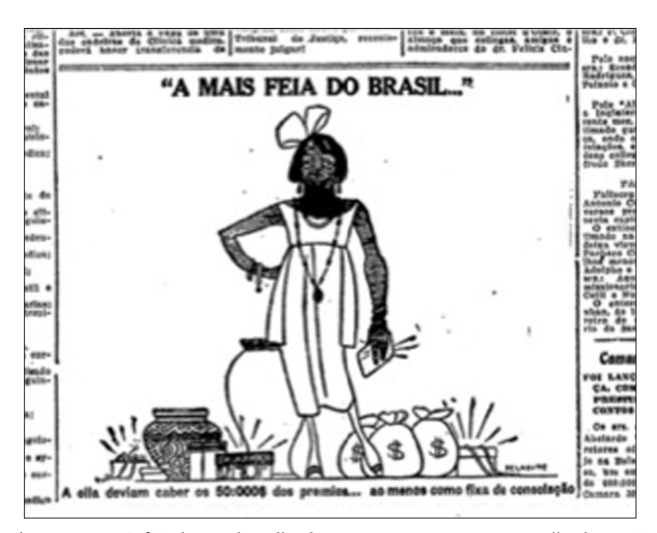
Figure 1: Belmonte, "A mais feia do Brasil," Folha da Noite , May 5, 1923.

When various newspapers collaborated to hold an extensive contest for "Miss Brazil" in 1929, the results were an extension of this eugenic ideology. Although the editors of these newspapers claimed that Brazilian beauty would reflect the country's racial diversity, they effectively barred nonwhite women from participating. Susan Besse points out that in contrast to the image of the "sexy mulata" that followed in later decades, descriptions and images of 1920s beauty contestants sanitized them as "virtuous virgin/mothers" whose sexuality was limited to reproducing a eugenically superior nation (Besse 2005, 103).<sup>8</sup>