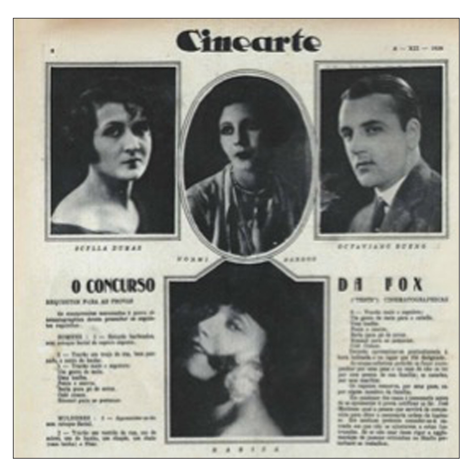
Figure 2: Photographs of various contestants printed in Cinearte , December 8, 1926, 8.