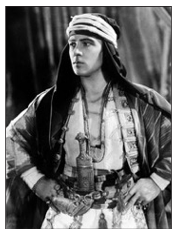
Figure 3: Rudolph Valentino in Son of the Sheik (United Artists, 1926).