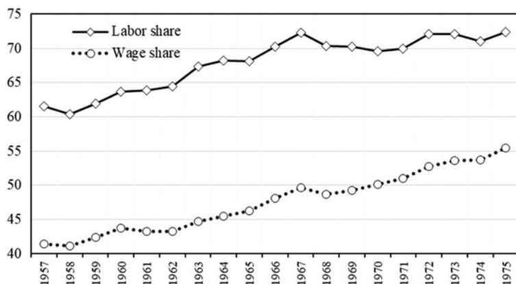
Figure 1. Evolution of the labor share and the wage share (1957–1975)

Notes: The wage share is the compensation of employees as a percentage of GDP at the cost factor. It includes wage payments for self-employed workers.