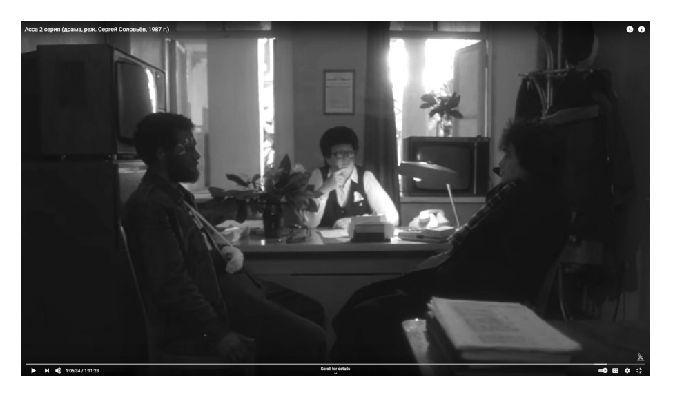
Figure 1. Still from Assa (1987)

my aim will be to use late-socialist deterritorialization to open unanticipated meanings around Tsoi's racial otherness, which is visible on screen in ways not possible with music.