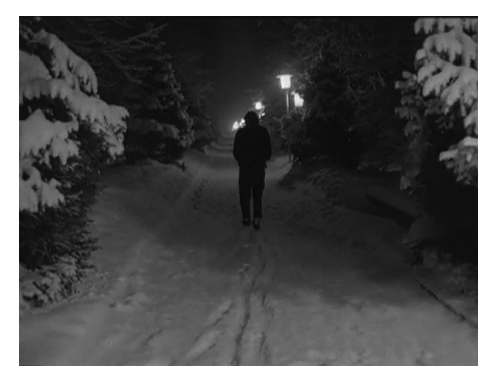
Figure 3. Still from Needle (1988)