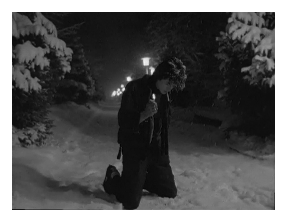
Figure 2. Still from Needle (1988)

Cut by the blade of his narrow eyes, "slanted and greedy," into the exhausted expanse, where everyone was already exhausted and tired of everything long ago, perhaps Tsoi should have hacked away this given world?<sup>55</sup>