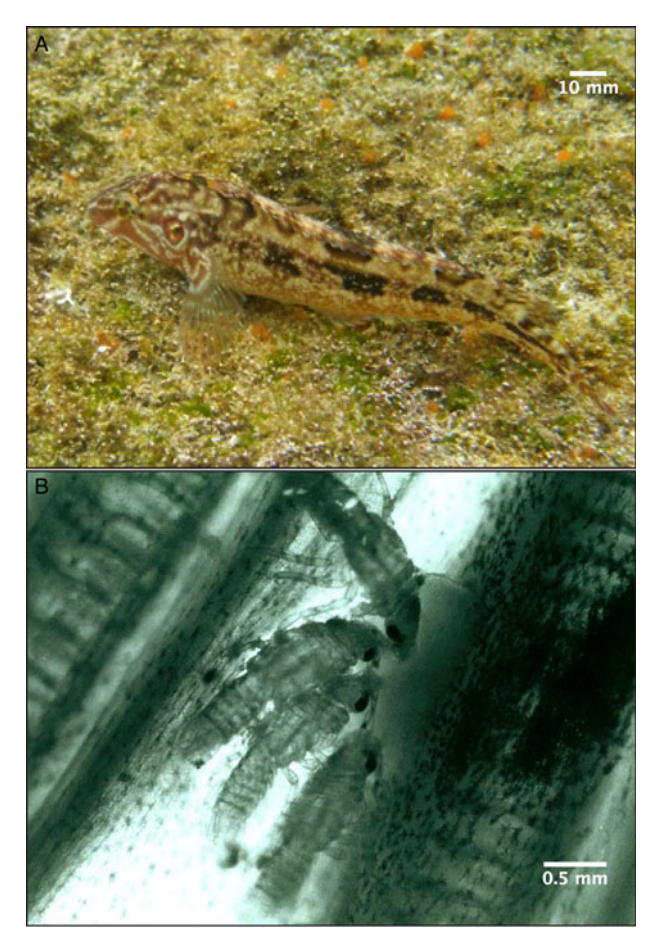
Fig. 2. (A) Clinus superciliosus. (B) Gnathia africana parasitizing Clinus superciliosus.