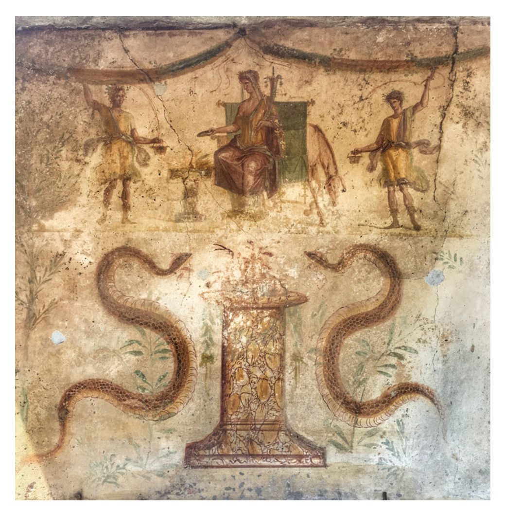
Fig. 6. Wall painting showing Vesta flanked by the lares, from a bakery (VII, xii, 11), Pompeii (photo by Farrell Monaco/Tavola Mediterranea (2018) su concessione della Ministero della Cultura — Parco Archeologico di Pompei).

The aedes Vestae type bears more than a passing resemblance to these seemingly conventional representations; it not only groups Vesta with a subordinate to either side, but also depicts the leftmost figure in the distinctive, almost idiosyncratic posture of a lar and places in its hands objects that certainly could be the conventional rhyton and patera. Furthermore, the characteristic, round shape of the aedes itself simultaneously recalls two of the objects around which lares are most commonly grouped — a domed niche containing a cult image and a rounded altar — and thus provides an additional, visual, link between the aedes Vestae type and household shrines to the lares (Fig. 7). On the other hand, however, the comparison of our coin type with other depictions of the lares also reveals a critical problem: although the