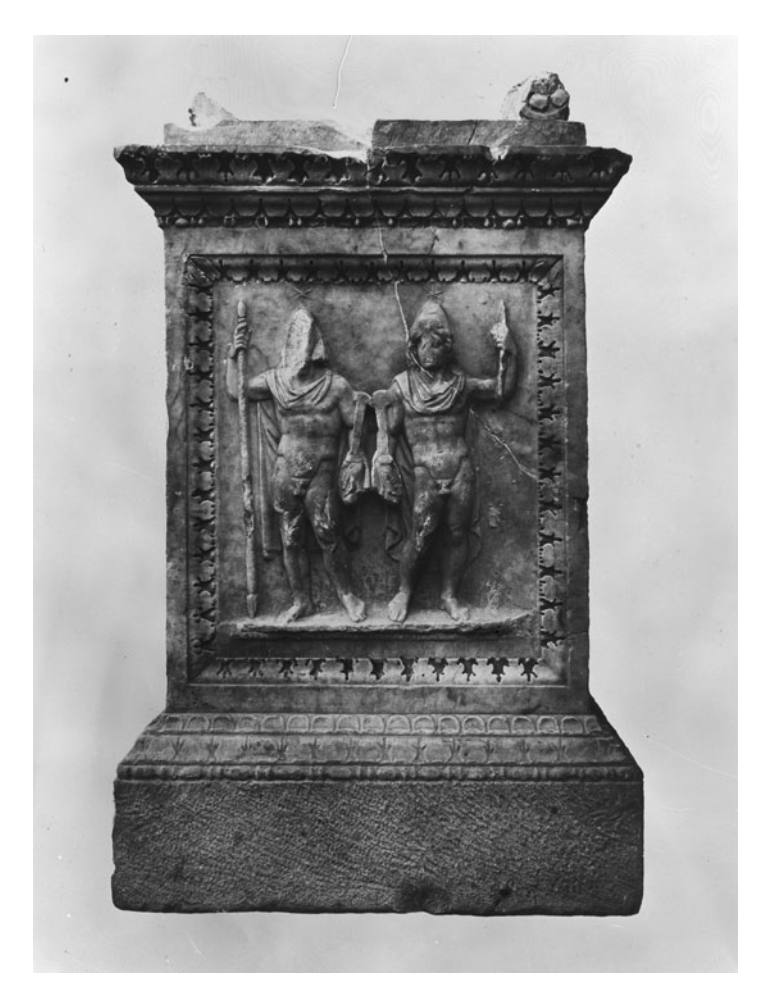
Fig. 8. Altar of the Castores at the Lacus Iuturnae.

with Vesta; and (iii) both have one manifestation that protected the individual domus and another that protected Rome as a whole. To elaborate, the domestic penates and the lares familiares protect the individual domus ; the penates publici and the lares praestites protect the patria as a whole.