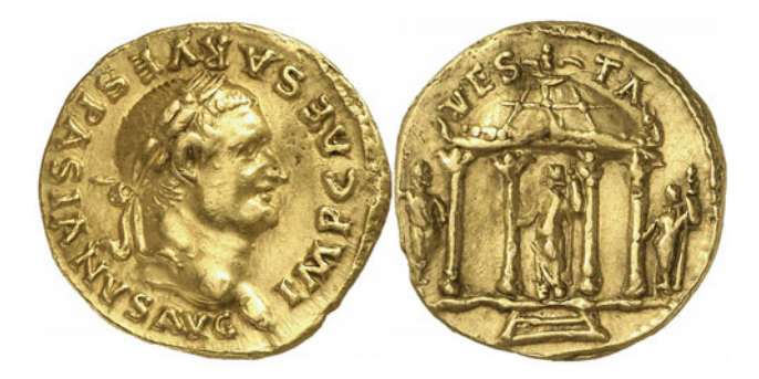
Fig. 2. Aedes Vestae aureus of Vespasian, Mint of Lyon (2× actual size) (Coin 230; Numismatische Sammlung der Deutschen Bundesbank).

attempts to identify the individual punches, known as dies, used to strike the coins. Since each die was engraved by hand and leaves an exact negative impression upon the coin, it is possible to determine, simply from examining the coins themselves, which coins were struck from the same, and which from different, dies (Metcalf, 2012: 5–6). While the vagaries of archaeological survival do not allow us to investigate more than a tiny fraction of the total number of coins originally minted, it is possible to gather a sample of coins that includes not only most of the dies that were originally used, but also most of the pairings between obverse and reverse dies. A die study thus takes us as close as possible to the original production process, which is crucial for both sections of this paper. For the iconographic analysis in Section 2, examination of all