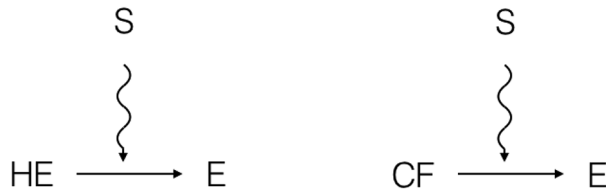
Figure 4. Wavy line represents another way systemic and proximate causes interrelate. This amplifying/damping relation holds when changes in a variable influence the strength of other causal relations, rather than the values the variables take on. The wavy line is not part of standard method of constructing directed acyclic graphs.

continues to bring about its effects. Changes to some systemic factors can increase or decrease the range of circumstances in which the occurrence of a human error stands in a causal relation with disasters. Hence, changes to this type of systemic factor appear to change the size of the invariance space of some proximate causes. In other words, some systemic causes can influence the stability of other causes. I call this relationship amplifying/damping .