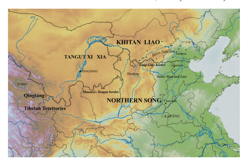
Figure 1. Northern Song and its Neighbors

1100) and Huizong (r. 1101–1125). But I hope to show that even before Shenzong's ascent, commitment to the Chanyuan paradigm had been eroded by growing frustration at key levels of the Song state over how to manage the unpredictable actions of the Tanguts and the ominous disintegration of the Tsongkha federation. In short, the expansionist wars of Shenzong and his sons can be traced directly to the fragility of the Qingli peace.