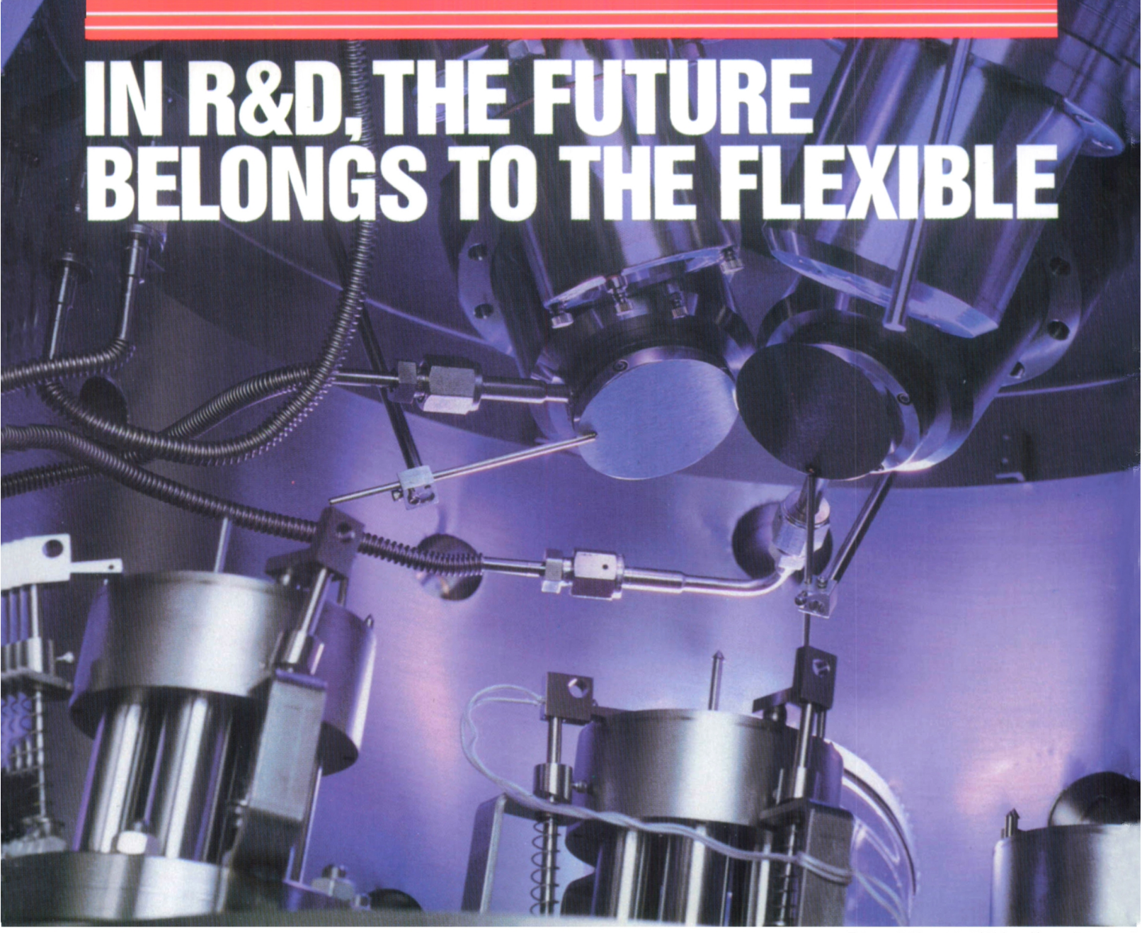
▲ A typical UHV internal arrangement for co-sputtering.