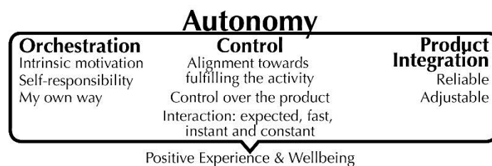
Figure 2. The constructs of autonomy in human-product interaction