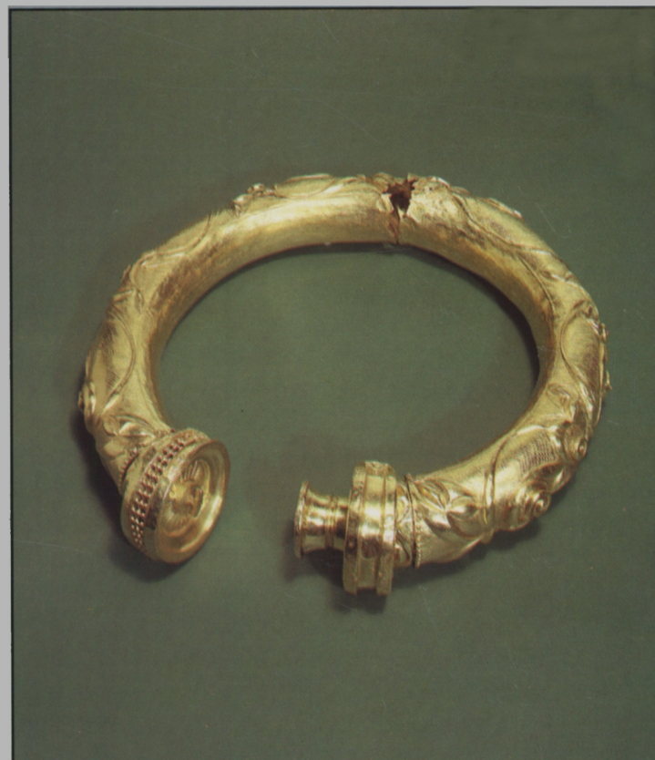
Front cover description John Dunne Medal

Indexed and abstracted by BIOLOGICAL ABSTRACTS (BIOSIS Previews) ; CENTRE NATIONAL DE LA RECHERCHE SCIENTIFIQUE/INIST: PASCAL ; EXCERPTA MEDICA/EMBASE ; INSTITUTE FOR SCIENTIFIC INFORMATION: CURRENT CONTENTS/Social & Behavioral Sciences (Social Science CITATION INDEX, Research Alert) ; PSYCHOLOGICAL ABSTRACTS (PsycINFO/PsycLIT) ; Cumulative Index to Nursing & Allied Health Literature, Current AIDS Literature (CAB Abstracts), International Pharmaceutical Abstracts, Linguistics & Language Behaviour Abstracts, Nutrition Abstracts and Reviews (CAB Abstracts), Referativnyi Zhurnal, Social Planning/Policy & Development Abstracts, Social Work Research & Abstracts, Sociological Abstracts.